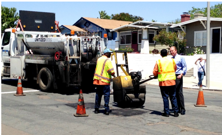
Mayor Kevin L. Faulconer conversing with a pothole repair crew

Faulconer's One San Diego budget proposal calls for 16 additional full-time City workers to focus solely on pothole repairs. Fourteen of those workers will join Asphalt Repair Crews, which target larger potholes, and are expected to double the amount of asphalt repaired annually. The City