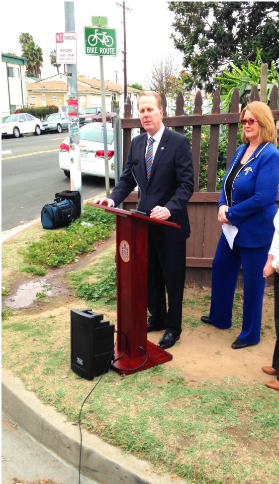
Mayor Kevin L. Faulconer in City Heights discussing the need for better sidewalks and streetlights

Mayor Kick-Starts One San Diego Plan in City Heights, Stresses the Need for Better Sidewalks & Public Facilities for Every San Diego Neighborhood