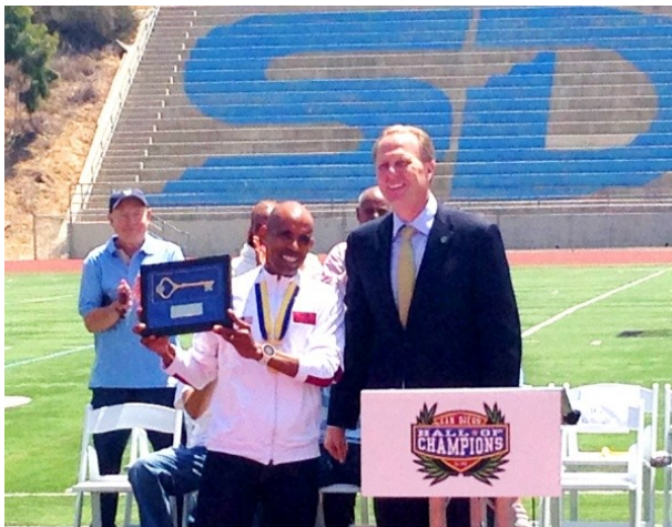
Meb Keflezighi awarded with the key to the city