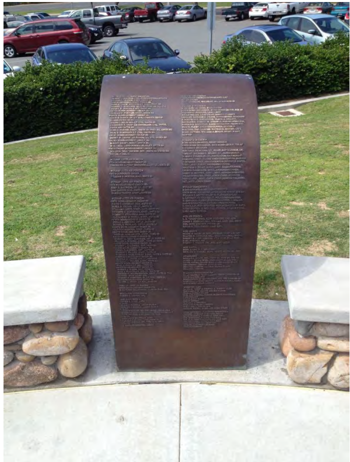
Figure 4 - B-24 Donor Plaque (typical of two)