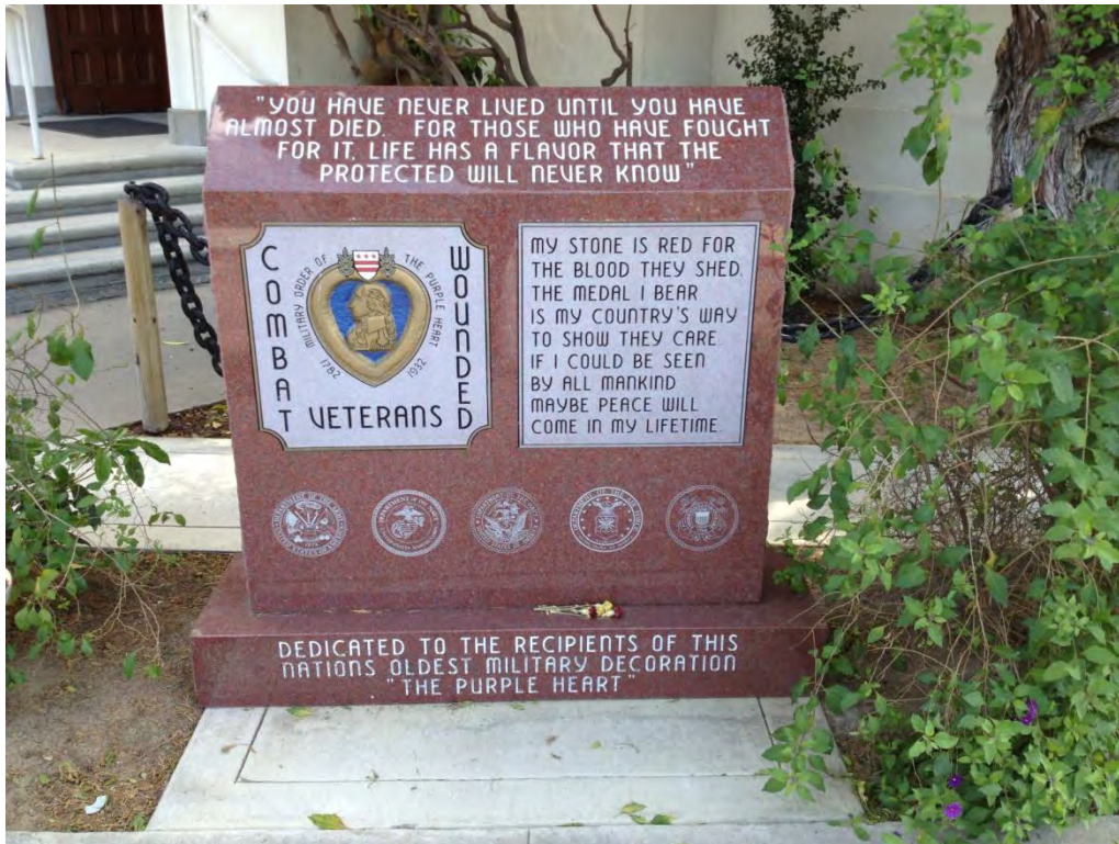
Figure 5 - Purple Heart Memorial (front)