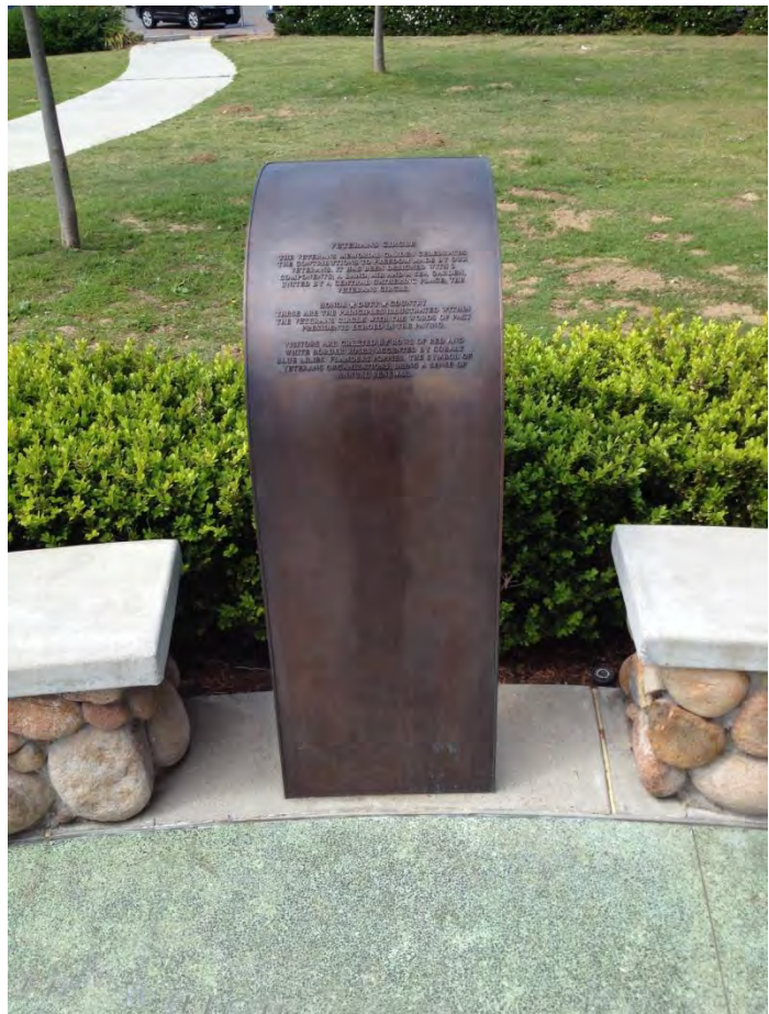
Figure 2 - Veterans Circle Informative Plaque