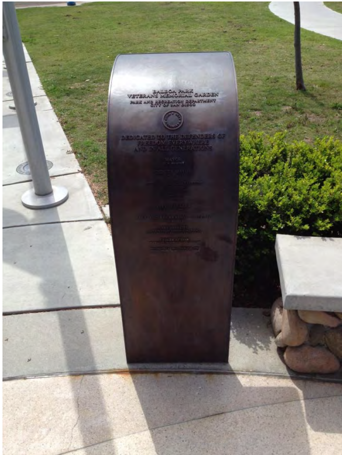
Figure 3 - Veterans Circle Dedication Plaque