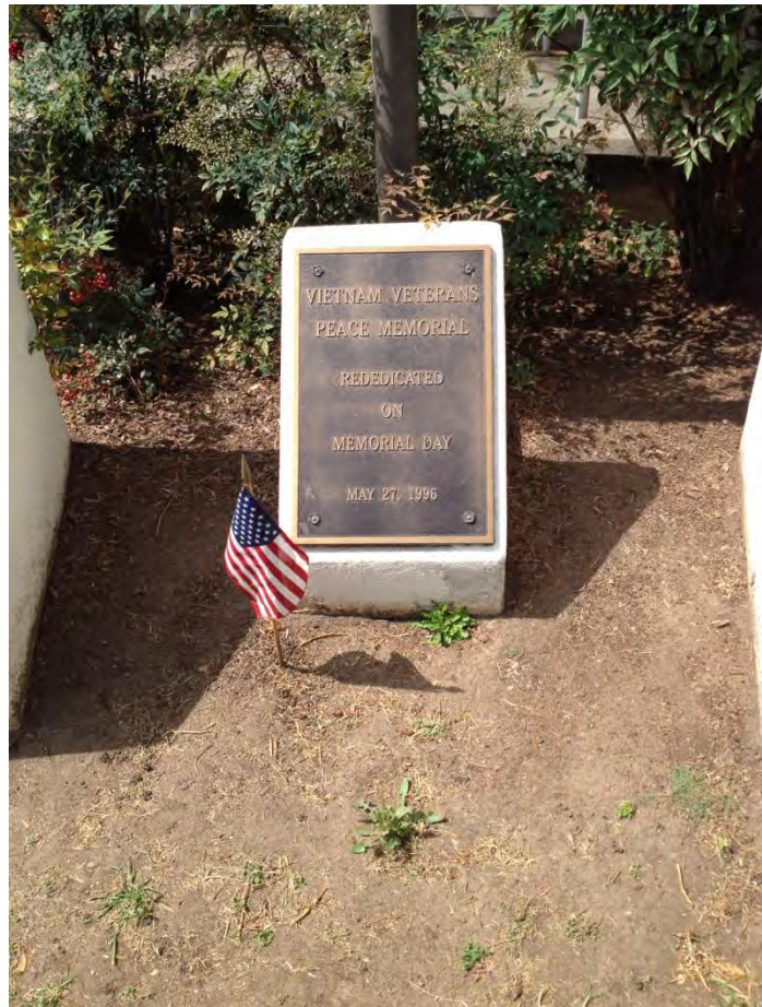
Figure 8 - Vietnam Veterans Peace Memorial Re-dedication Plaque