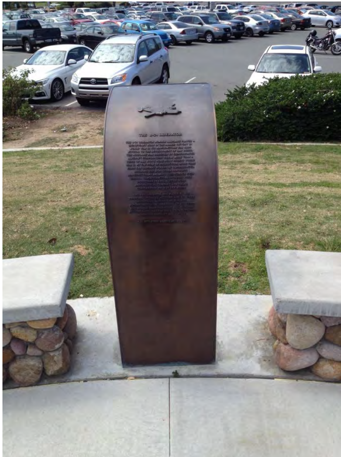
Figure 1 - B-24 Liberator Plaque