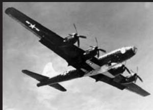
Cardenas' B-29 bomber, with Chuck Yeager's X-1 rocket plane attached and ready for launch over Muroc AFB in 1947.

After six months, and with the help of the Swiss underground and French Resistance, he escaped through France and was able to rejoin U.S. forces.