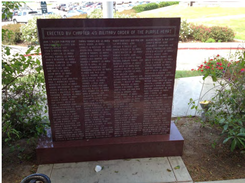
Figure 6 - Purple Heart Memorial (back)