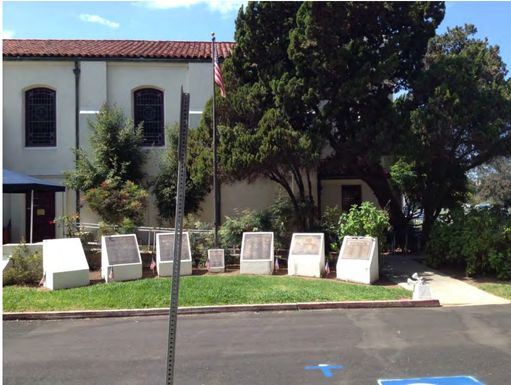
Figure 7 - Vietnam Veterans Peace Memorial