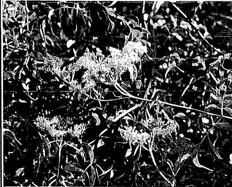
Mexican Elderberry ( Sambucus mexicana )