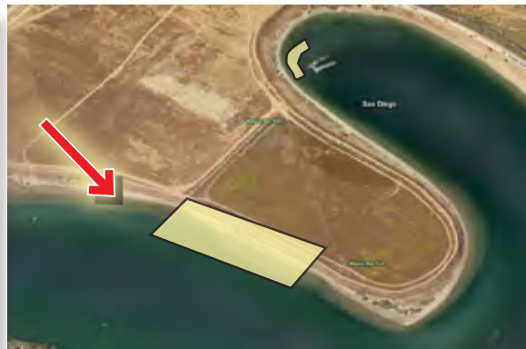
Site Aerial Oblique