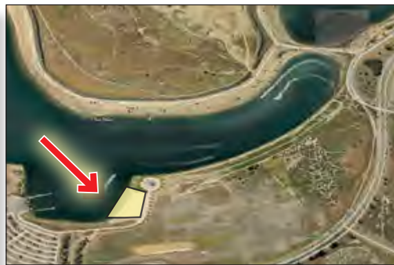
Site Aerial Oblique