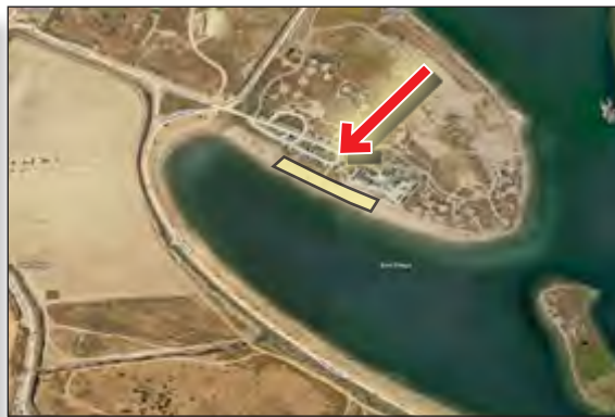
Site Aerial Oblique