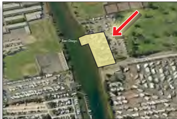
Site Aerial Oblique