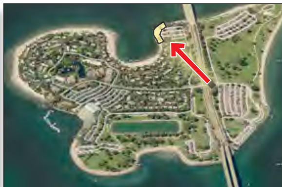
Site Aerial Oblique