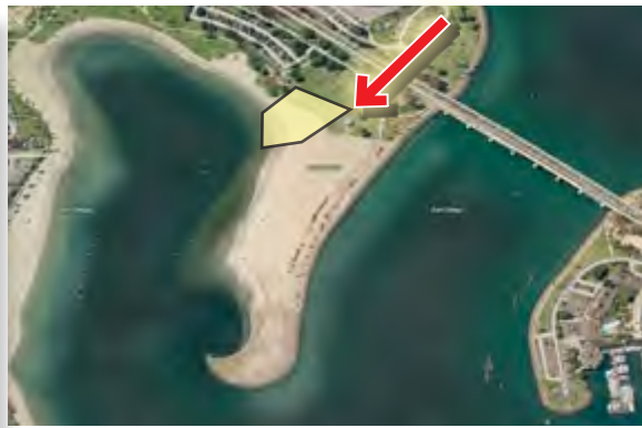
Site Aerial Oblique