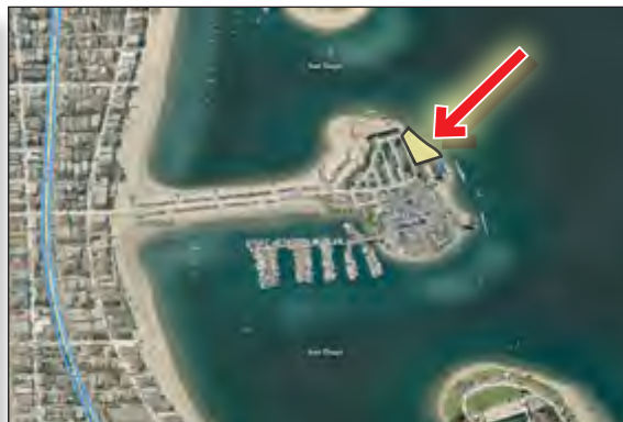
Site Aerial Oblique