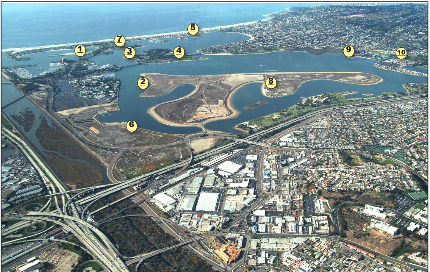
Figure 1: Site Locations