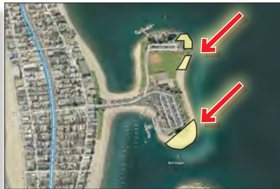
Site Aerial Oblique