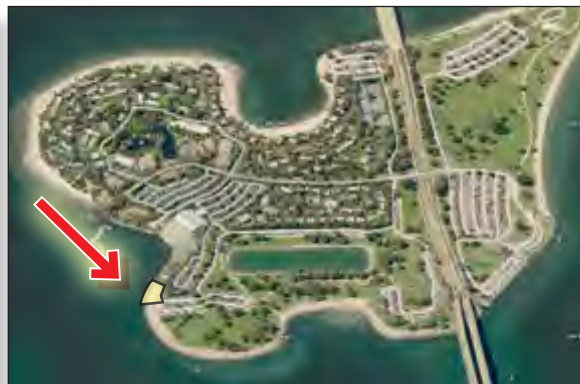
Site Aerial Oblique