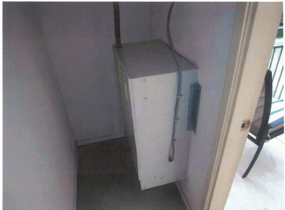
24) Typical of air conditioner units mounted in exterior closets.