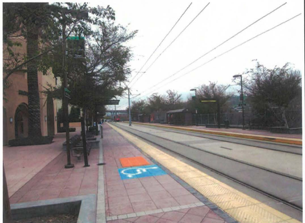
14) View of trolley tracks looking east from station on site.