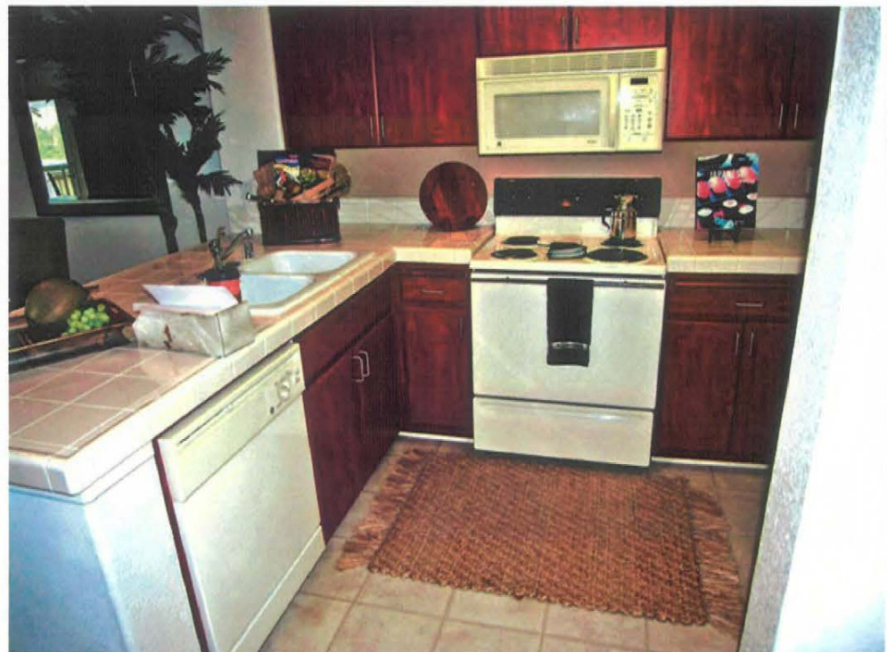
18) Typical of apartment kitchens and appliances.