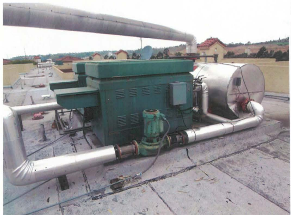
26) Typical of roof-mounted boiler units and storage tanks with circulation pumps.