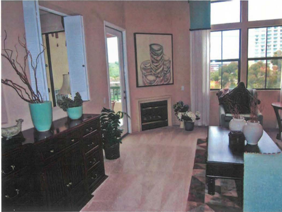
21) Typical of apartment units with fireplaces.