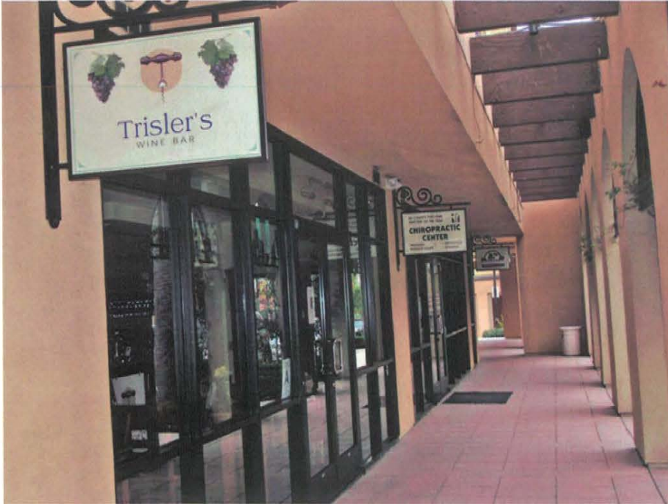
15) View of commercial spaces on site.