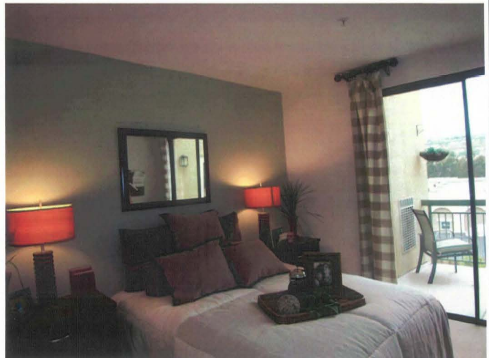
20) Typical of apartment bedrooms.