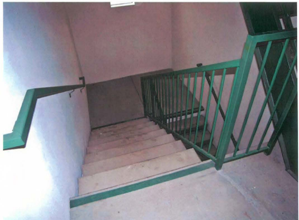
28) Typical of interior emergency stairs.