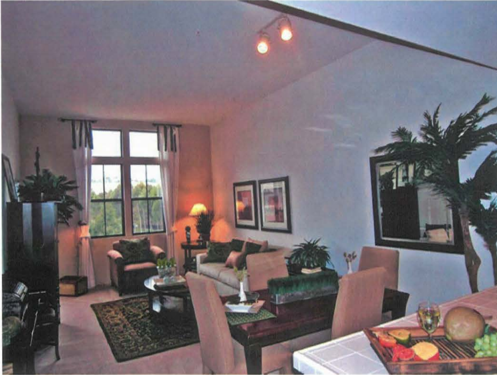
17) Typical of apartment living rooms.