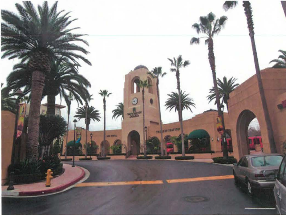
13) View of site trolley station.