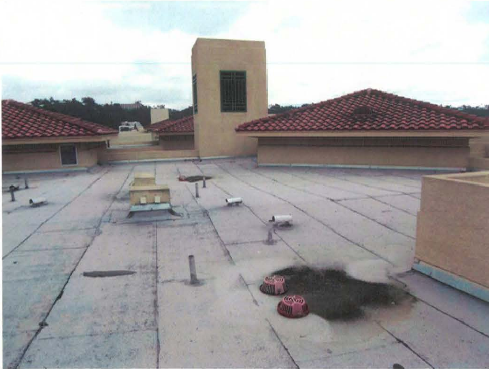
25) Typical of roofing materials.