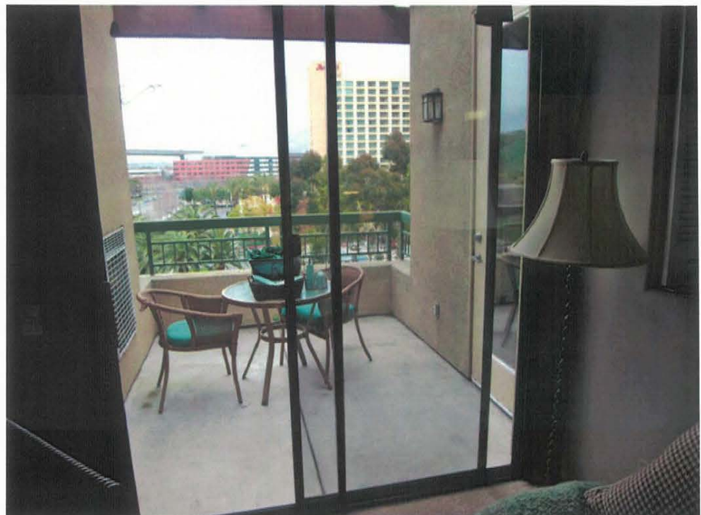
22) Typical of balcony and patio finishes.