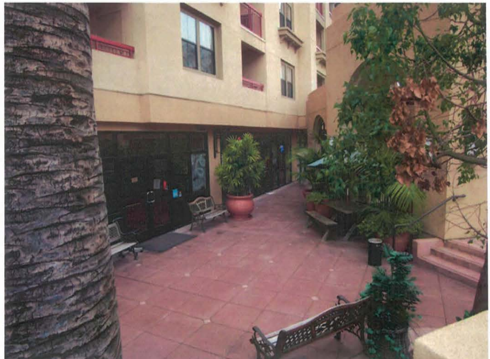
16) View of courtyard at commercial spaces on site.