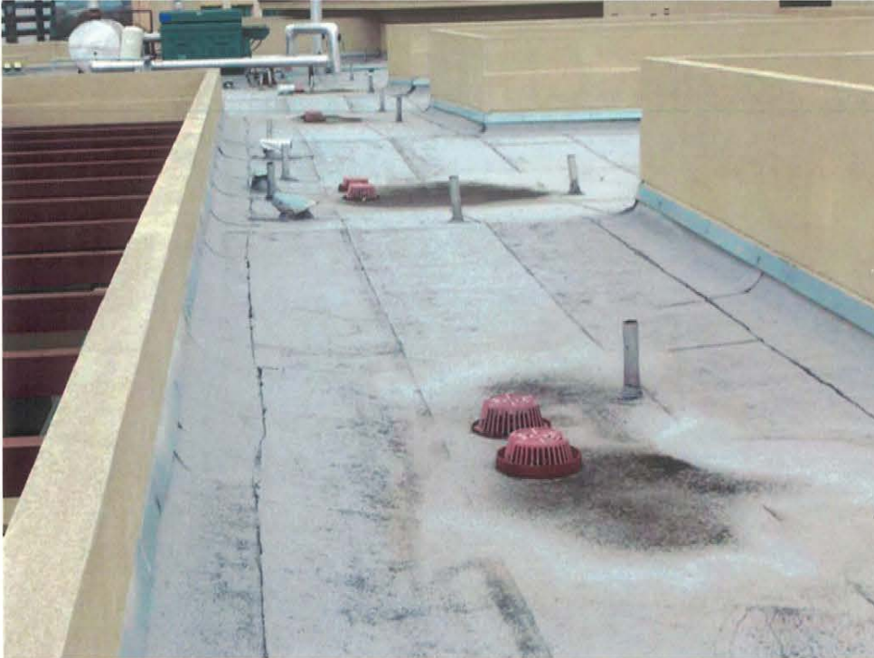
27) Typical of roof drains and overflow drains.