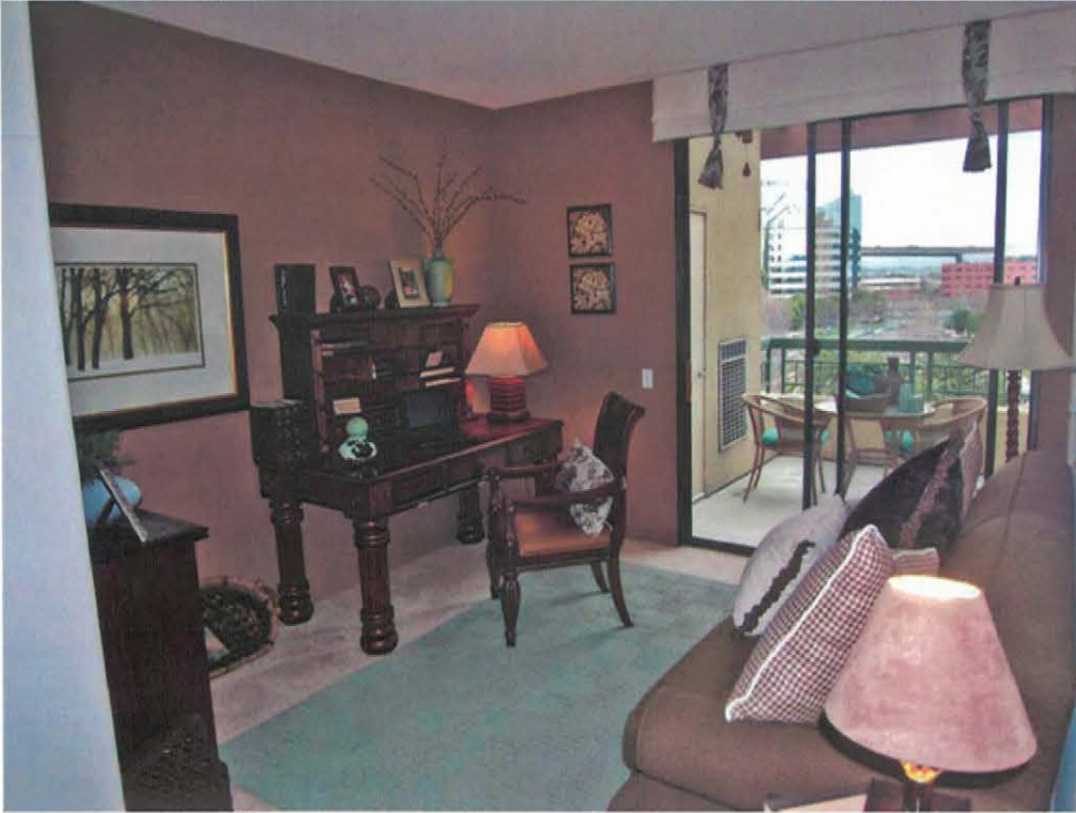
23) Typical of apartment finishes.