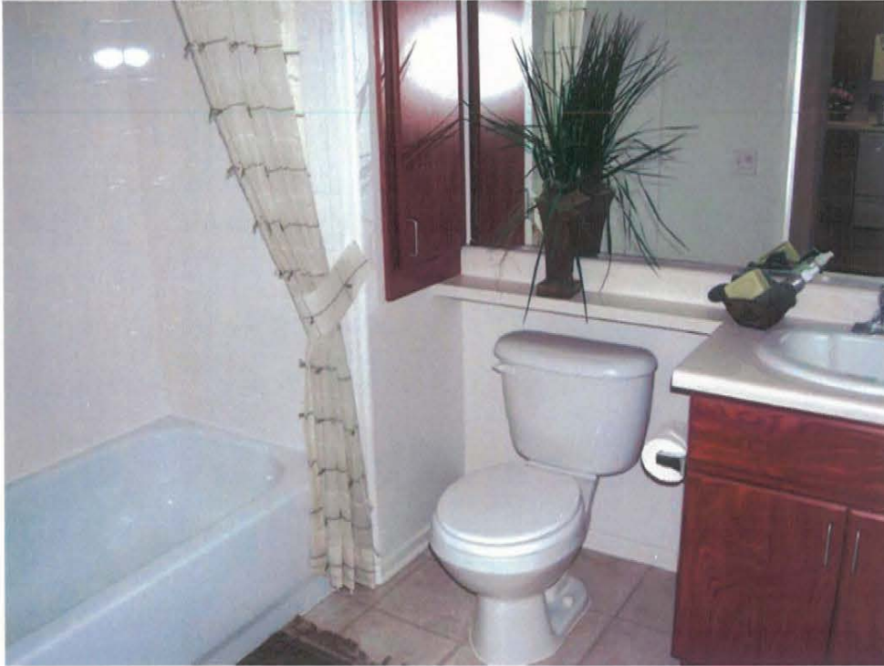
19) Typical of apartment bathrooms.