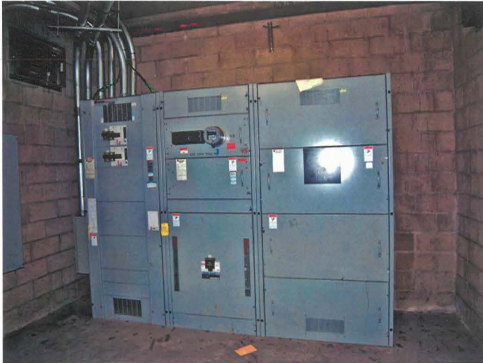
31) Typical of main electrical panels.