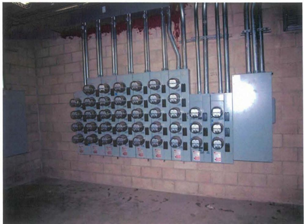
32) Typical of individual electric meters at buildings.