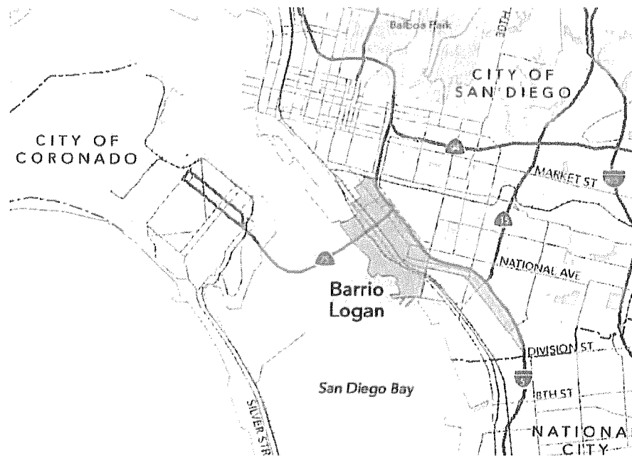
FIGURE 2-1 VICINITY MAP OF THE PLAN UPDATE

The Plan Update will establish goals and policies for future private development and public facilities improvements. Future development will implement the policies contained within the City's General Plan while enhancing the community for existing and future community residents, businesses and organizations.