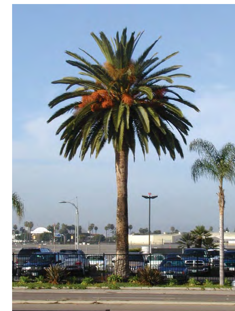
Canary Island Palm Phoenix canariensis