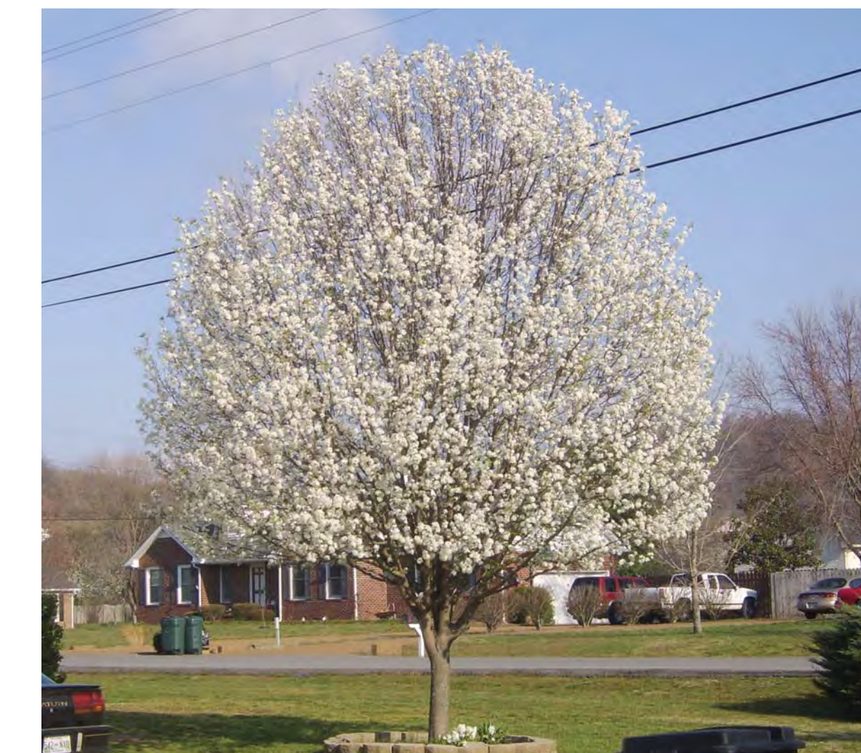
Bradford Pear Pyrus calleryana