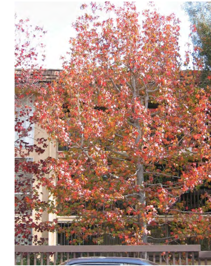
American Sweet Gum Liquidambar styraciflua