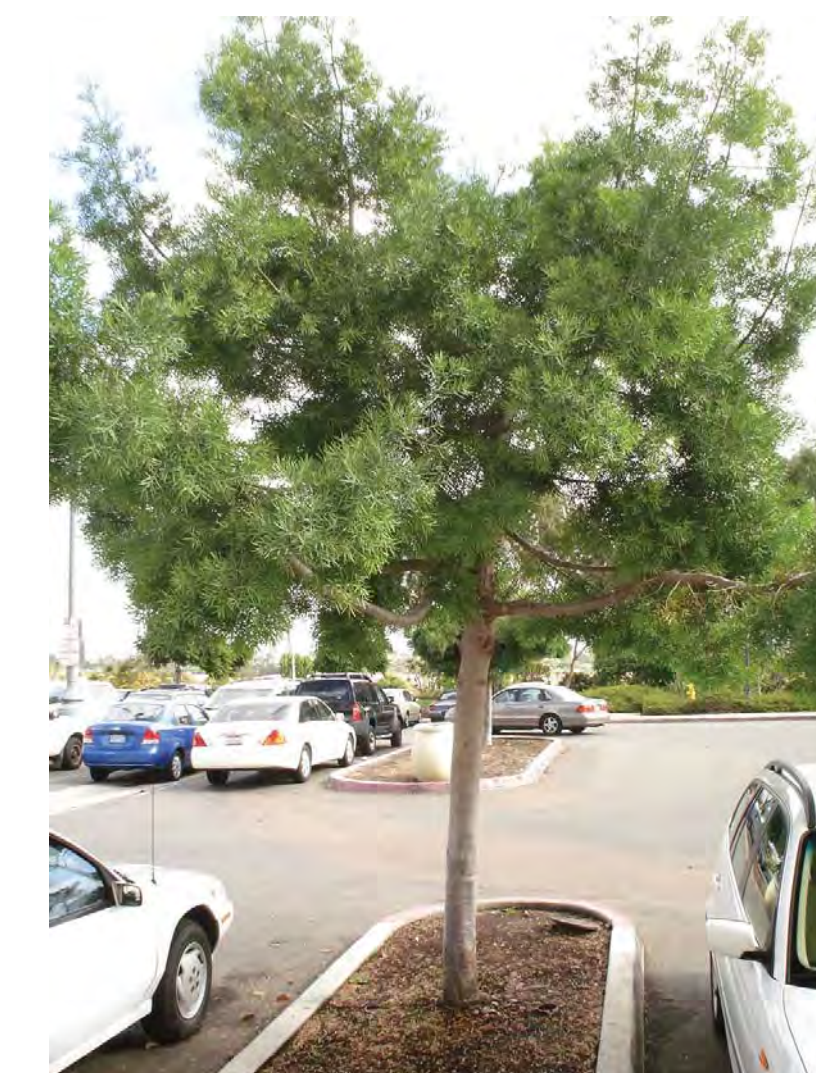
African Fern Pine Podocarpus gracilior