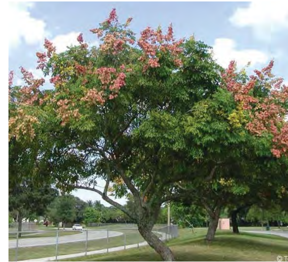
Goldenrain Tree Koelreuteria paniculata