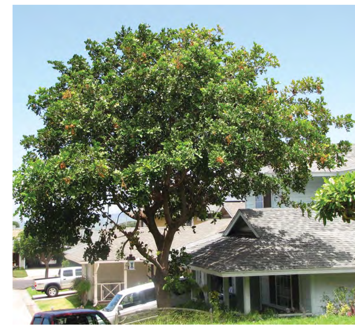
Carrot Wood Cupaniopsis anacardioides

The above trees were selected to show a sampling of common street trees already found in the neighborhoods. These trees show a range of options that each offer trade-offs for aesthetics (e.g. flowering), maintenance, water issues, size, shade offering, and overall character.