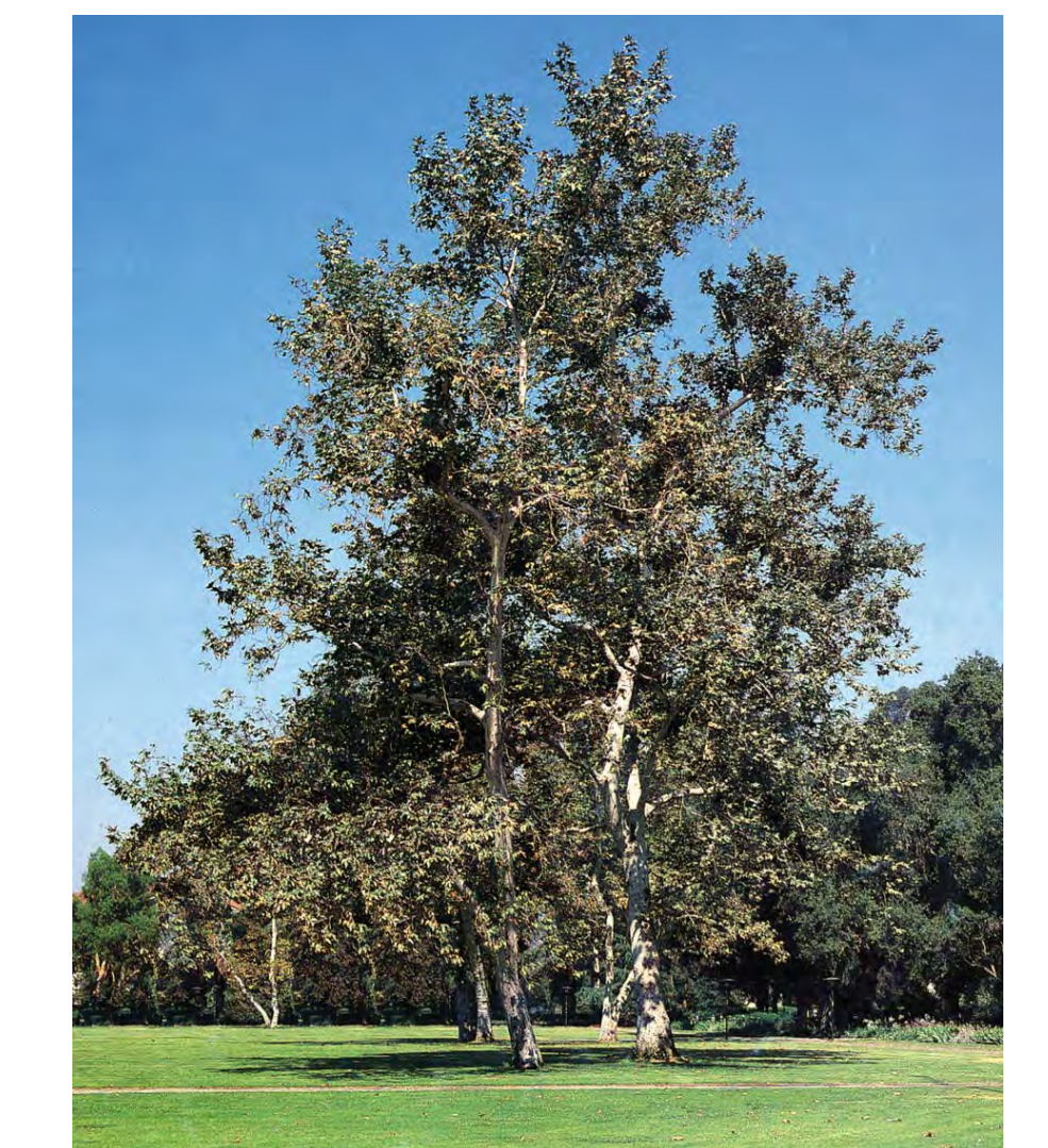
California Sycamore Platanus racemosa