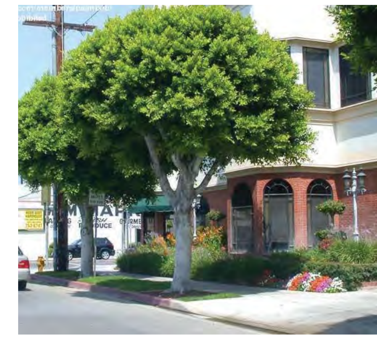
Indian Laurel Fig Ficus Microcarpa