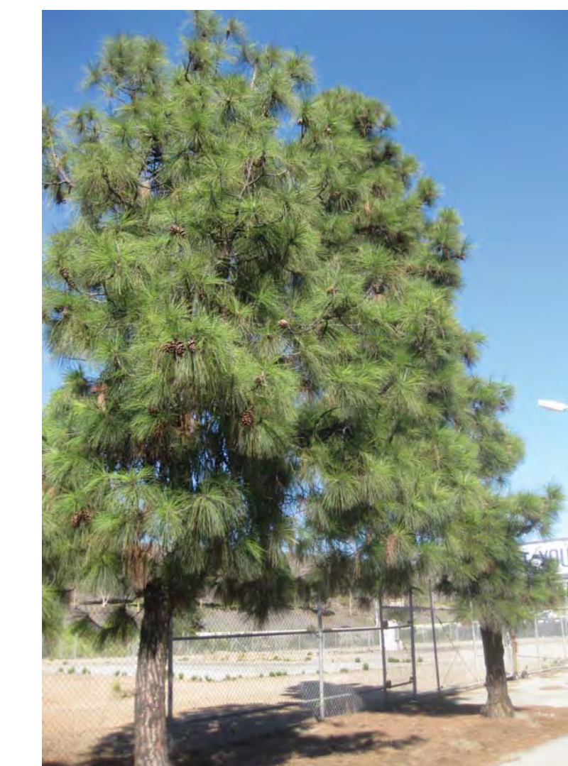
Canary Island Pine Pinus canariensis