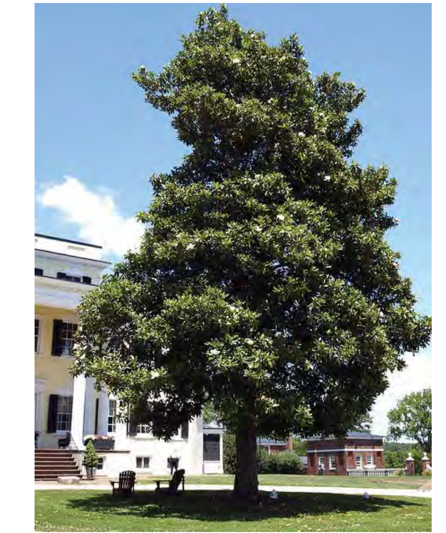
Magnolia Magnolia grandiflora