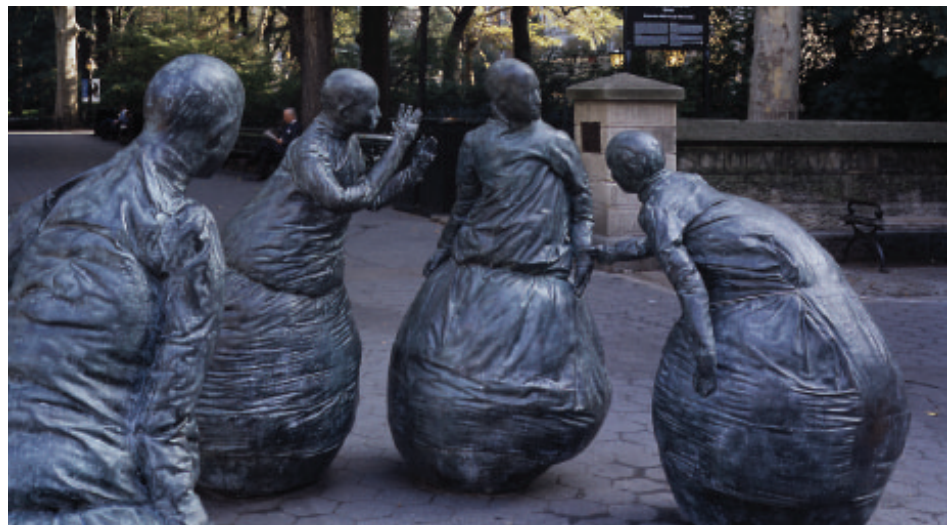
Juan Munoz Conversation Piece New York City Public Art Fund

The Commission for Arts and Culture, through its Public Art Program, should update the Public Art Master Plan every five years.