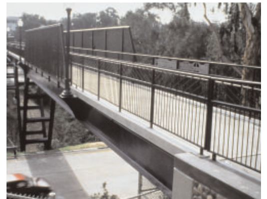
Stone Paper Scissors Vermont Street Bridge Hillcrest