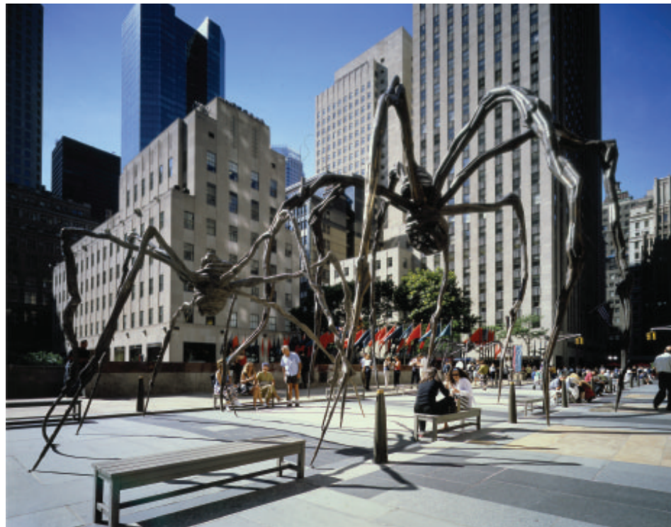
Louise Bourgeois Spiders New York City

Privately donated artworks should require a maintenance endowment to ensure for the long-term care of the artwork.