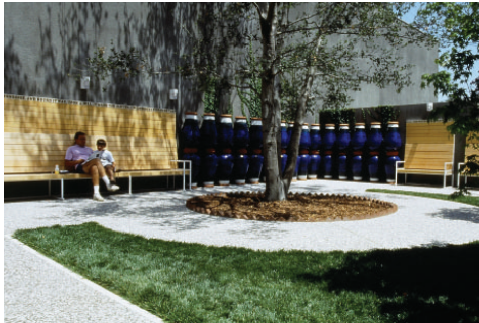
Siah Armajani Poetry Garden Los Angeles

The Commission for Arts and Culture, through its Public Art Program, should emphasize the artistic and visual relationship between San Diego and Tijuana in some public art projects.