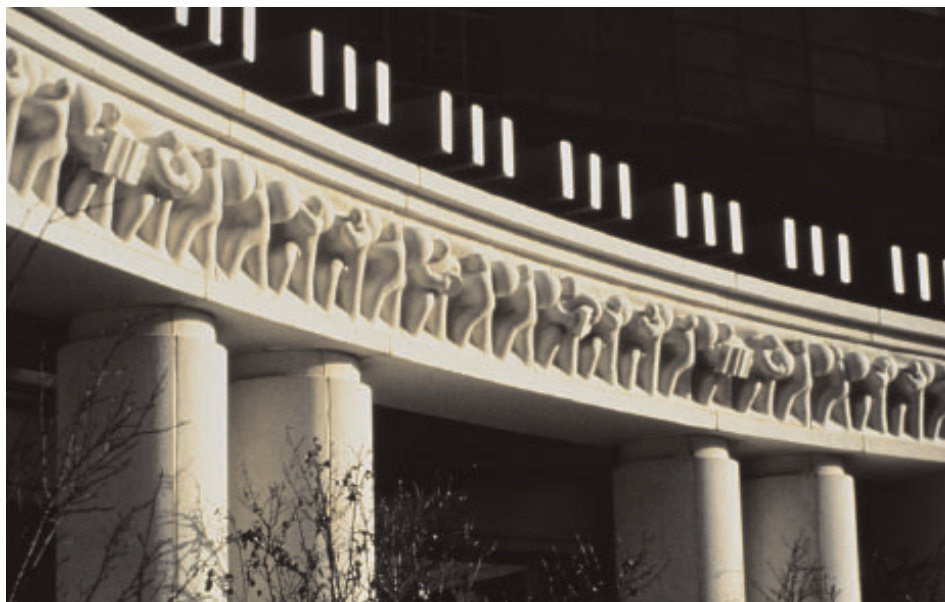
Tom Otterness The New World Los Angeles Federal Court Plaza