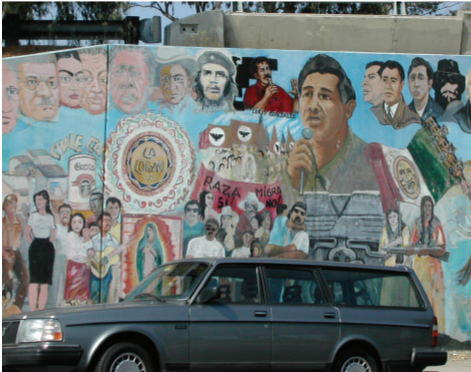
Chicano Park Barrio Logan