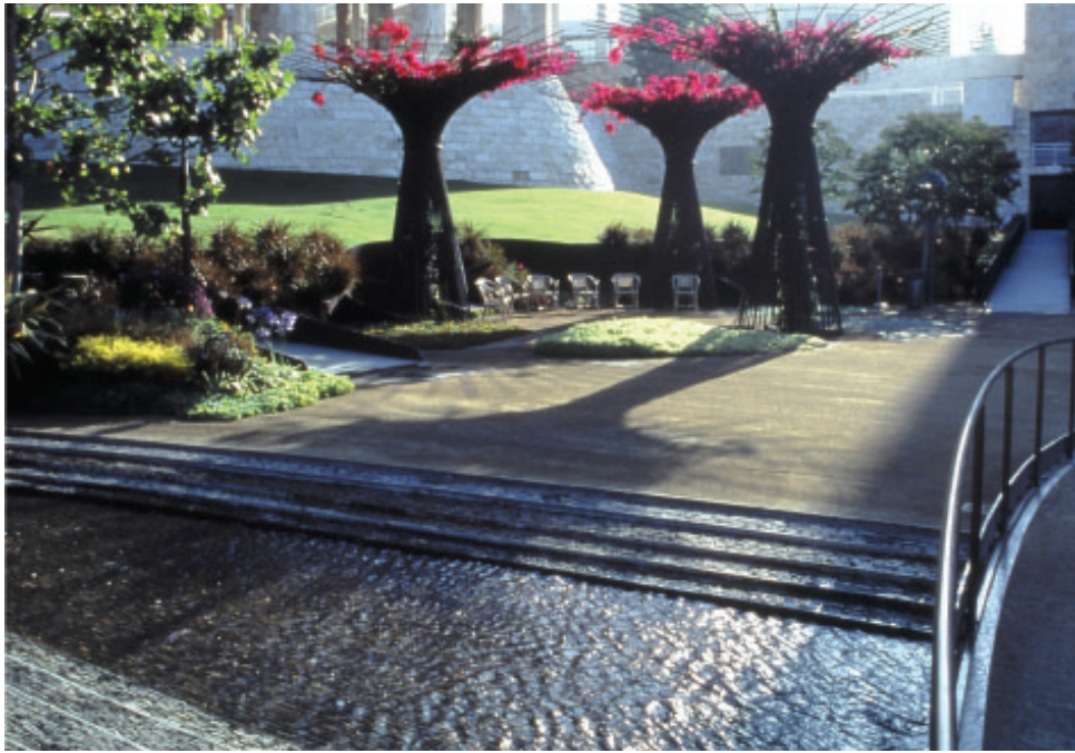
Robert Irwin Central Garden Getty Center, Los Angeles