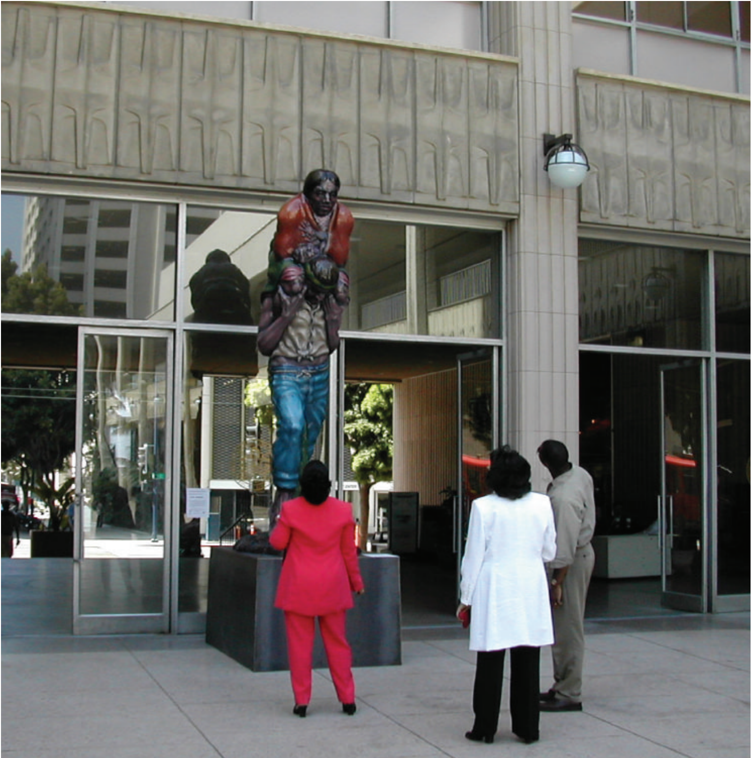
Luis Jimenez Border Crossing City Concourse On loan to the City of San Diego from the San Diego Museum of Art and the Museum of Contemporary Art San Diego