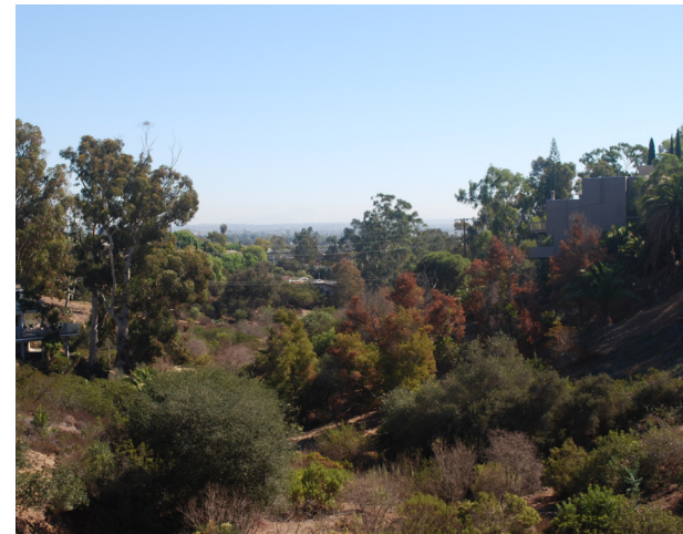
32nd Street Canyon Open Space Trail, viewed from Cedar Street, will be enhanced with proposed trail amenities including trail kiosk signs, trash containers, and benches where appropriate.

In Golden Hill, there are two open space canyons, 32nd Street Canyon and 34th Street Canyon, which provide low intensity recreational uses, such as hiking and bird watching. Within 32nd Street Canyon there are 3,604 lineal feet of existing trails and in 34th Street there are 4,754 lineal feet of existing trails. Any proposed improvements to the trail systems shall be in compliance with any Natural Resource Management Plans or other governing documents.