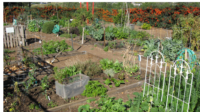
The Golden Hill Community Garden located on Russ Boulevard, within Balboa Park, is to be expanded incorporating amenities such as a stage/gathering area, picnic facilities, potting shed, security lighting and public art.