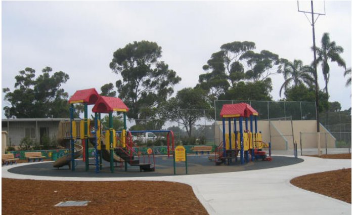
A children’s play area is one of the park amenities within Golden Hill Community Park.

General Plan Guidelines Parks: 22,085 people divided by 1,000 = 22.09 x 2.8 acres = 61.84 acres of population-based parks Recreation Center:(17,000 square feet) serves population of 25,000: 22,085 people divided by 25,000 people = 0.88 Recreation Center Aquatic Complex: serves population of 50,000: 22,085 people divided by 50,000 people = 0.44 Aquatic Complex