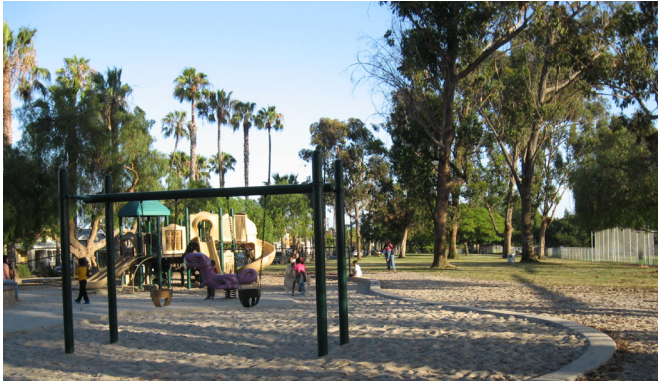
28th Street Park will be expanded to include additional park amenities such as picnic tables, exercise course or seating areas.