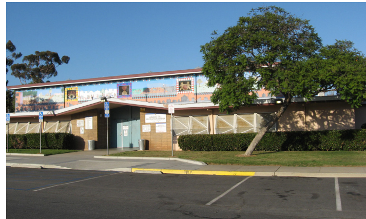
Golden Hill Recreation Center to be expanded to provide additional multi-purpose rooms or other community serving facilities.