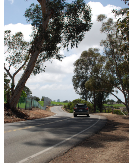
A pedestrian pathway along Golf Course Drive, viewed from 28th Street, is planned to connect the Golden Hill Recreation Center to 28th Street.

Accessibility also means the availability of active and passive recreation to all community residents. The Golden Hill Community Park is programmed to allow organized sport leagues use of the facilities at specific times while making the facilities available at other times for unstructured play and impromptu users. The schedule is adjusted each year to make sure a balance is provided for community residents. When special uses are designed into parks, such as dog off-leash areas or community gardens, these areas should also include amenities, such as pathways, benches, exercise stations, or picnic tables on the perimeter that could accommodate more than one type of user and enhance the recreational and leisure experience. Special uses, such as dog off-leash areas and community gardens, would be required to undergo a City approval process prior to facility design.