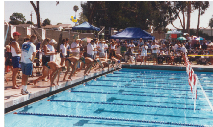
Bud Kearns Aquatic Complex, within Balboa Park, is to be expanded to serve both Golden Hill and North Park communities.

Figure 7-1 depicts the approximate locations of existing and proposed open space, parks, recreation facilities and park equivalencies. Note: Identification of private property as a potential park site does not preclude permitted development per the designated land use or underlying zone.