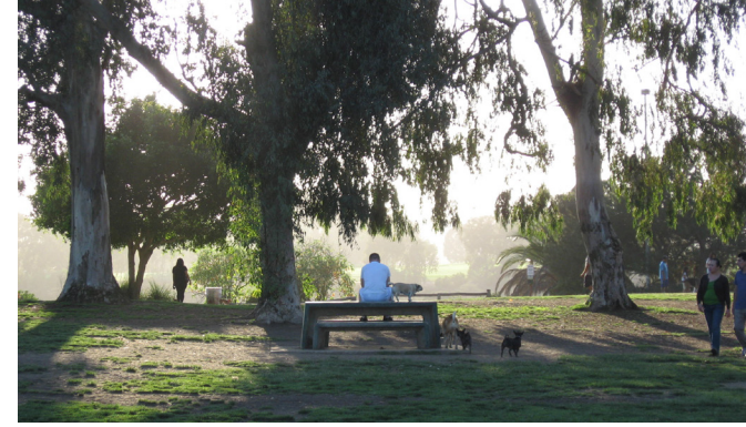
Grape Street Park, within Balboa Park, to expand the use of the park with new park amenities such as children's play area, picnic areas, or upgrades to the dog off-leash area.