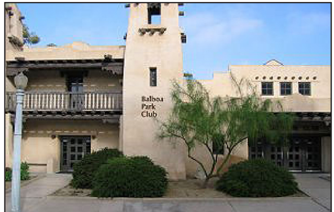
Balboa Park Club

The recent update to the General Plan calls for the update of the City's various community plans in order to establish these plans as integral and essential components of the new General Plan. The General Plan sets out a long-range vision and policy framework to guide future development, provide public services, and maintain the qualities that define San Diego over the next 20+ years. It also represents a shift in focus from how to develop vacant land to how to design infill development and reinvest in existing communities. This focus is reflected throughout the Plan, including such topics as sustainable development, urban design, the provision of public services & facilities, mobility and historic preservation. The community plan update process will develop the community-specific detail, relevant policies, and implementation strategies necessary to fulfill General Plan objectives.