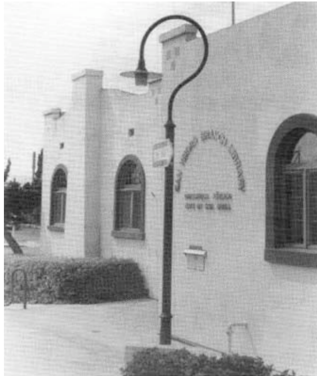
The San Ysidro Library

The library is located on San Ysidro Boulevard at the southern end of the linear park and is adjacent to the senior citizens' center. Originally built at 1,264 square feet, the library was remodeled in 1984 and tripled in size to 4,089 square feet. The library contains 20,500 volumes, 6,000 of which are in Spanish. This is the largest Spanish language book collection in the City's library system and serves a community that is roughly 75 percent Spanish speaking. The library also serves as an archive of San Ysidro history with a small collection of turn-of-the-century San Ysidro photographs and documents.