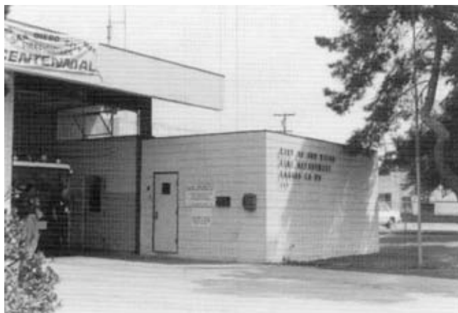
Station No. 29

The San Ysidro library is adequate for the present needs of the community, according to General Plan standards, which state that a branch library serves a population of up to 30,000 people. Parking, shared with the senior citizens' center, is also adequate. The Library Department's future plans for expansion include a new 10,000-square-foot library facility in the San Ysidro community to meet anticipated future growth and a new 10,000-square-foot facility in Otay Mesa as that community develops.