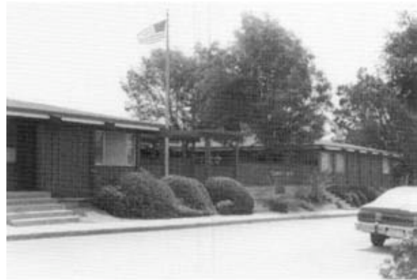
The MAAC Center

Several social agencies serve San Ysidro. One of these is the MAAC (Metropolitan Area Advisory Committee) Center, a non-profit social service agency located in the linear park in the center of the community.