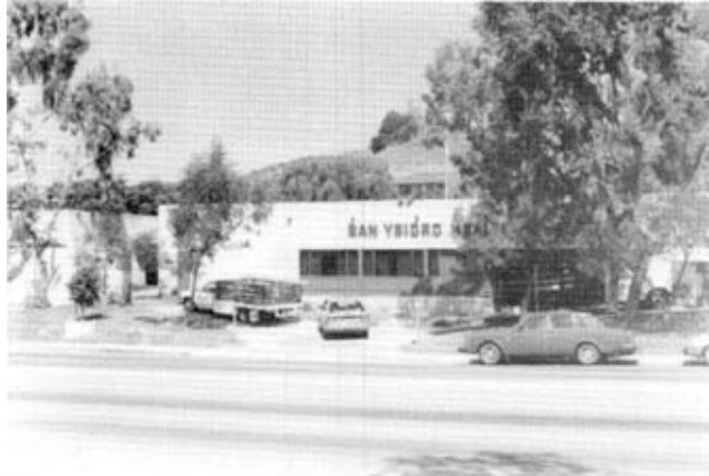
The San Ysidro Health Center

The center offers a wide range of health services, including dental and mental. In 1989, the staff consisted of approximately 150 full-time and 50 part-time employees. The center covers approximately 40,000 square feet divided between three buildings. In 1987, the center served 14,955 patients and in 1988, the center projected 18,700 patients would be served. The on-site parking is currently over-burdened, requiring patients to park on the street.