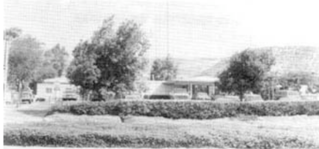
Southern Division of the San Diego Police Department

The police station, the headquarters of the Southern Division of the San Diego Police Department, was built in 1960 and is located on San Ysidro Boulevard, two blocks from the international boundary. In 1989, the station was supported by a staff of 100 people, each assigned to one of six beats. The staff has outgrown its present building and the possibility of a new location, in Otay Mesa, is being studied.