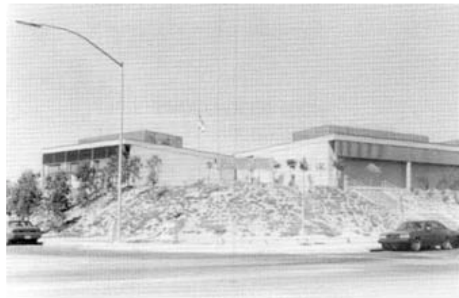
Southwestern Adult Center

Many of San Ysidro's schools are overcrowded. The population of the community has dramatically increased in recent years from 14,584 at the time of the 1980 census to 22,130 (from a City of San Diego Planning Department study of January 1988). This increase has been due, primarily, to the construction of low-income, multifamily apartments. This rapid development has not been tied to the development of new schools and other public facilities. Instead, the school districts have initiated multi-track school programs at several of the schools, increased class sizes and increased the use of temporary structures (portables).