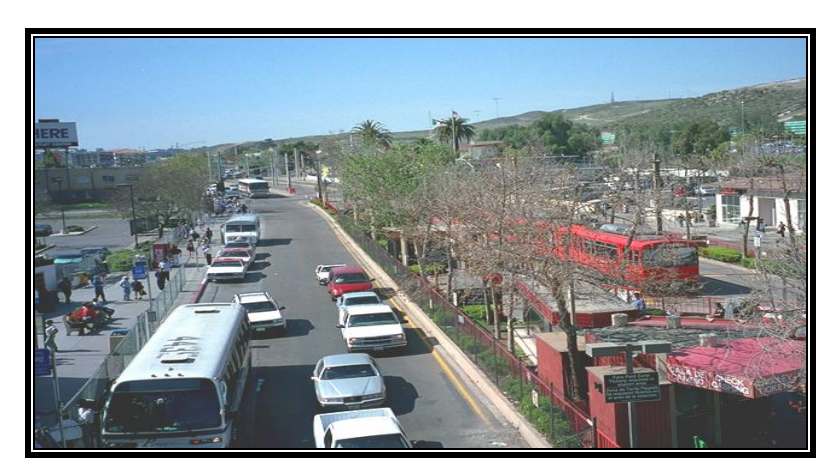
San Ysidro Trolley Station 1999