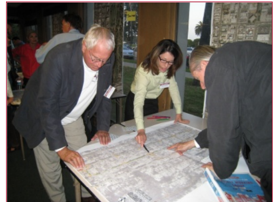
Figure 1C – Southern Corridor