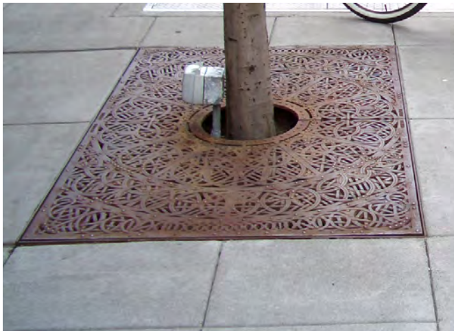
Tree grates should be used in commercial and mixed-use areas to reflect street and neighborhood character and protect trees.