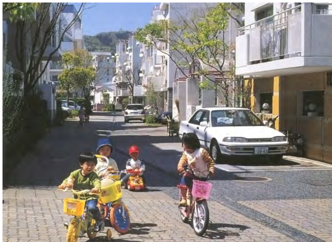
Alleys should be encouraged as safe spaces for community interaction.

throughout Uptown, with sidewalks fourteen (14) feet in width found in the Hillcrest core, while sidewalks in other commercial areas are much narrower. Safe, comfortable pedestrian environments will only occur where the design of the public realm balances the concerns for automobile efficiency with those for a high quality pedestrian environment. As such, the design of the sidewalk and its elements is critical to the creation of an active and pedestrian-friendly environment, safe neighborhoods, and vibrant commercial and mixed use districts.