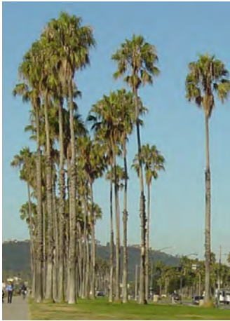
Mexican Fan Palm ( Washingtonia robusta )