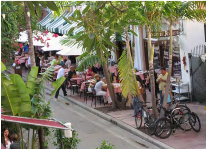
Alleys in commercial areas can serve an intimate social function.

There are multiple desirable functions that alleys can perform beyond vehicular use. Alleys can provide access from rear parking lots to streetfront entrances either directly through alley-side entries or by means of the mid-block breezeways. They also can provide a secondary route for pedestrians and bicyclists to navigate through the commercial districts. Additionally, they can provide venues for markets, street parties, and other special events. With the addition of improvements, these other functions can be greatly enhanced.