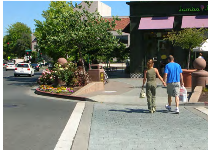
Pedestrian crosswalks should be designed to enhance the designated pedestrian area within the street.