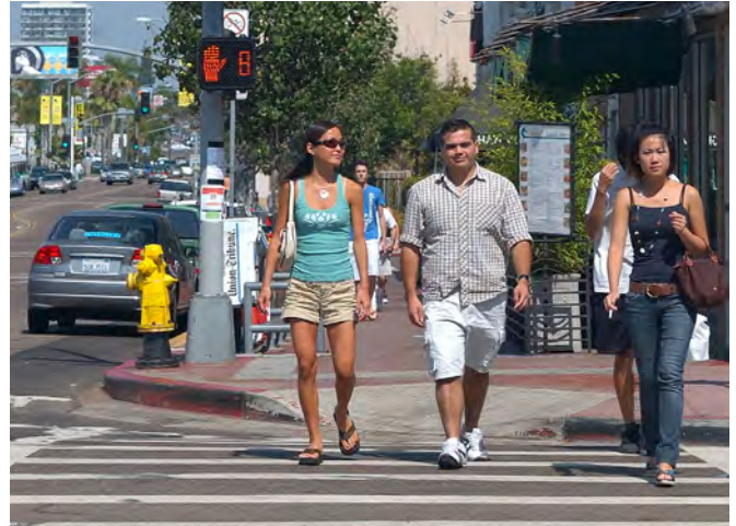
Pedestrian "countdown" signals should be installed at all signalized intersections to improve pedestrian comfort, such as Fifth Avenue.

Street furnishings encompass seating, such as benches, street lighting, bicycle racks, newspaper racks, refuse containers, and tree grates. Furnishings refer to those maintained as part of the public realm, rather than those maintained by individual