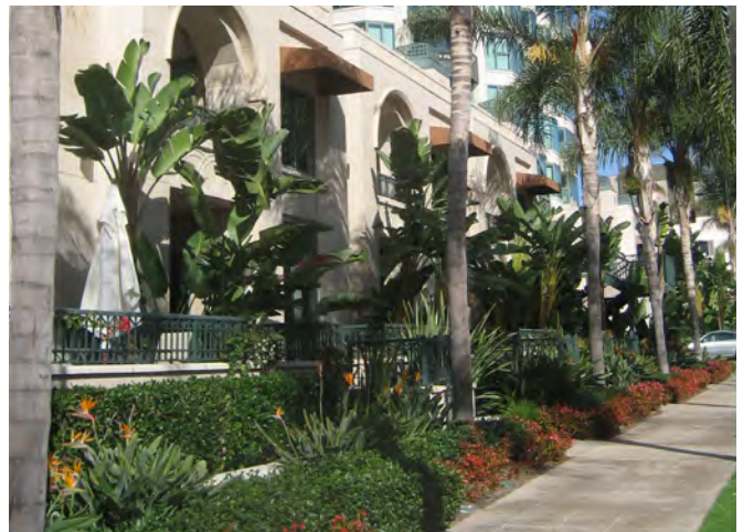
Green Streets should be lushly landscaped, creating green connectors between parks and neighborhoods.