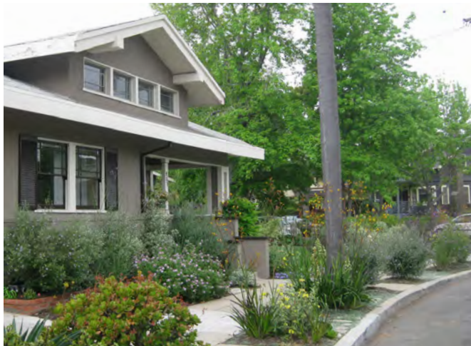
In residential areas, a planting strip should be included between the curb and sidewalk to create a buffer pedestrians and street.