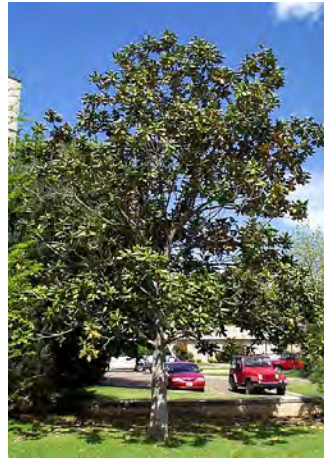
Southern Magnolia ( Magnolia grandiflora )