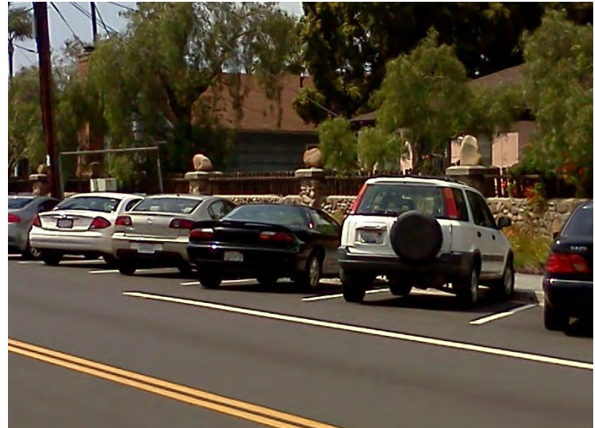
Adding diagonal parking on one side of the street may be appropriate in residential areas where generous right-of-way is available