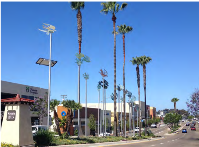
Community gateways can be combined with public art and streetscape elements such as iconic planting.