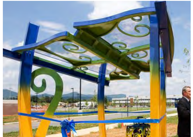
Transit stops may incorporate public art elements to express community identity