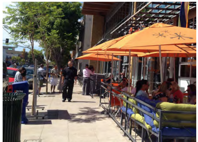
Sidewalk cafes are popular in Uptown and are an important element of the interface between the public and private realm.