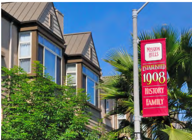
Wayfinding signage may be in the form of permanent installations or seasonal banners meant to mark neighborhood identity or events.