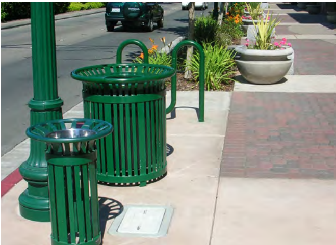
Street furnishings should communicate a consistent overall style and aesthetic