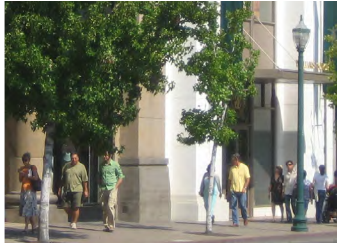
Street lighting should be incorporated into areas of high pedestrian activity.