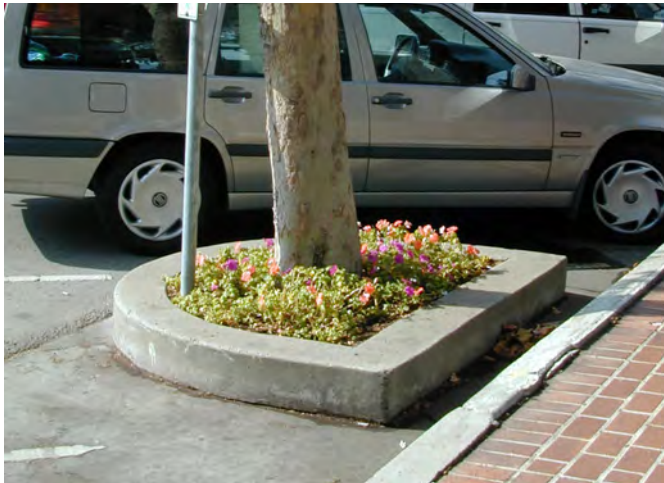
Plantings within the parking lane contribute to streets' visual character and reduce the apparent width of the street and vehicular travel speeds.

angled parking on lower-speed and lower-volume streets.