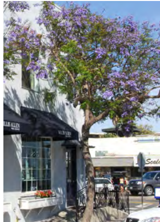
Jacaranda ( Jacaranda mimosifolia )