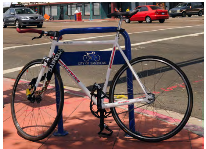
Bicycle racks should be durable and located outside of the pedestrian realm.