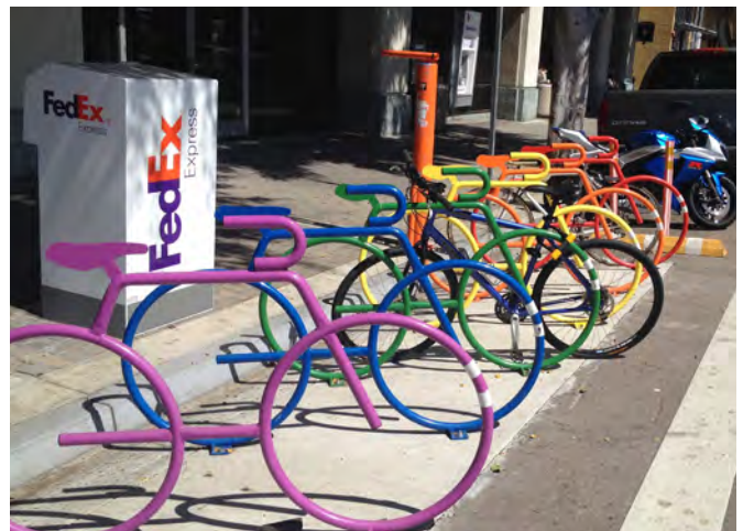
Bicycle parking within the parking lane is ideal for accommodating bicycle racks within the public right-of-way.