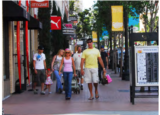
Sidewalks in commercial and mixed-use areas should be maintained to accommodate pedestrians and promote walkability.