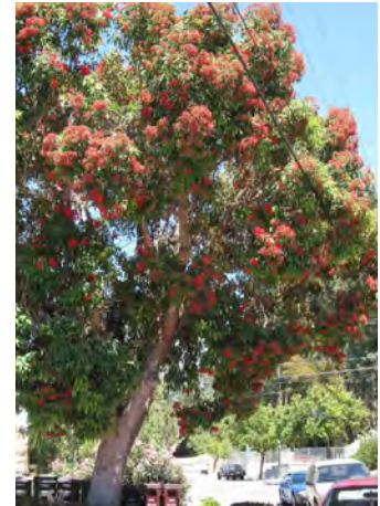
Silver Dollar Gum ( Eucalyptus polyanthemus )