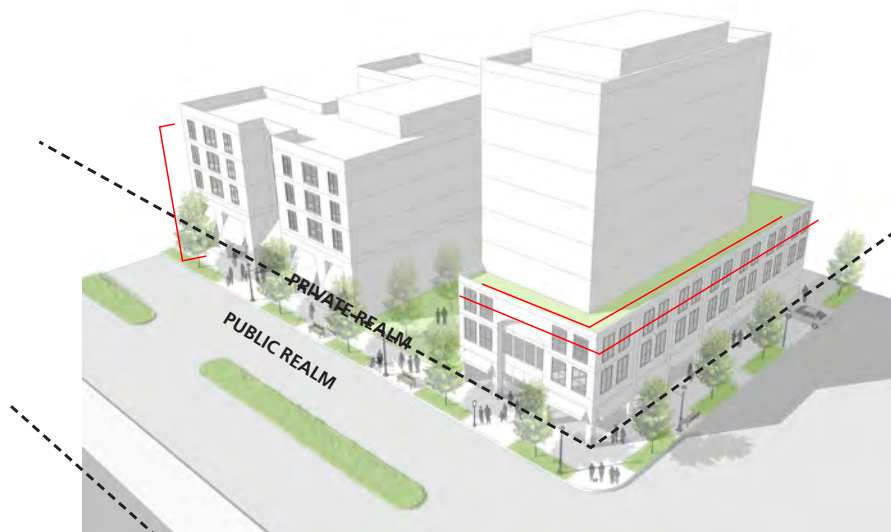
Diagram of Public vs. Private Realm

In the past, considerations for street function have often placed a priority on the efficient movement of motor vehicles. The present guidelines for streets and the public realm promote a