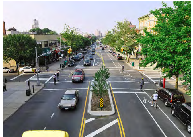
Major Through Corridors should promote modal balance and incorporate complete streets elements where feasible