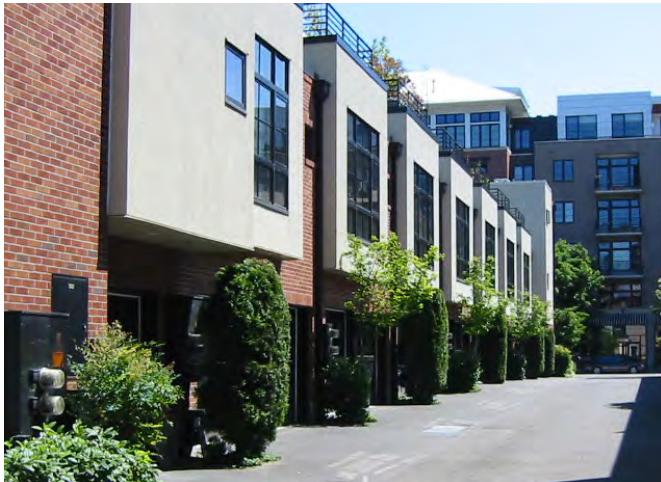
Landscaping should be included in alleys if possible, with minimal exposure of trash bins and other utilities.

Sidewalks are the primary areas within the public street right-of-way that are reserved specifically for pedestrian use. They also serve as the interface between buildings and the street, providing both connection and buffer. Sidewalk widths vary