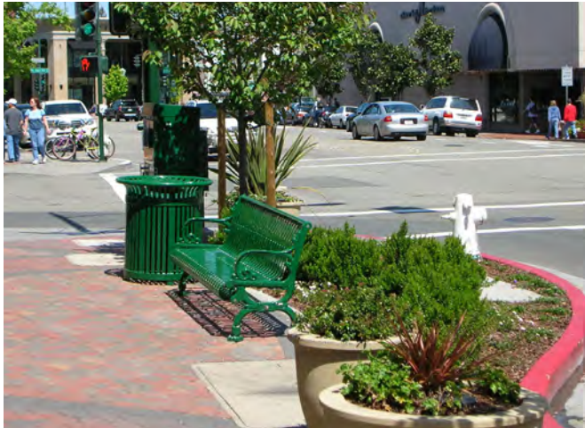
Curb extension or neck-downs may be included to enhance pedestrian safety and add planting area.