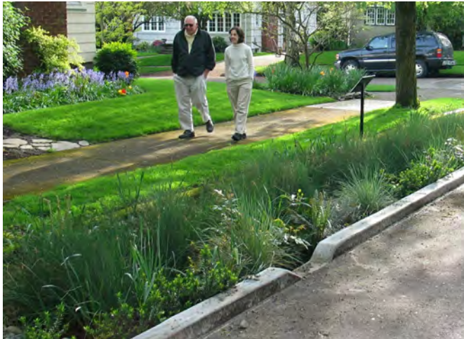
Green Streets should include planting strips that contribute to stormwater management with climate-appropriate species.