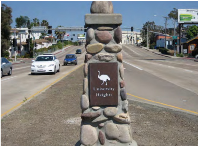
Community gateways should address multiple scales and incorporate elements of individual neighborhood identity.