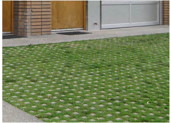
Permeable paving treatments are encouraged in areas of the public realm in both new construction and existing development.