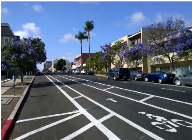
Bicycle paths and lanes create designated spaces for bicycles, thereby promoting bicycle use and safety.