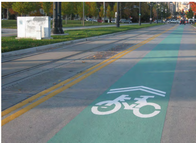
Bicycle boulevards are designated with prominent markings to indicate the presence of bicycle use.