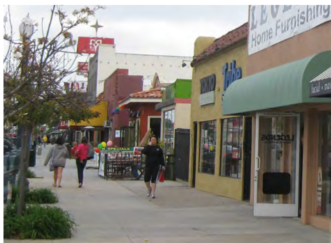
University Avenue is a pedestrian-oriented Street in Hillcrest