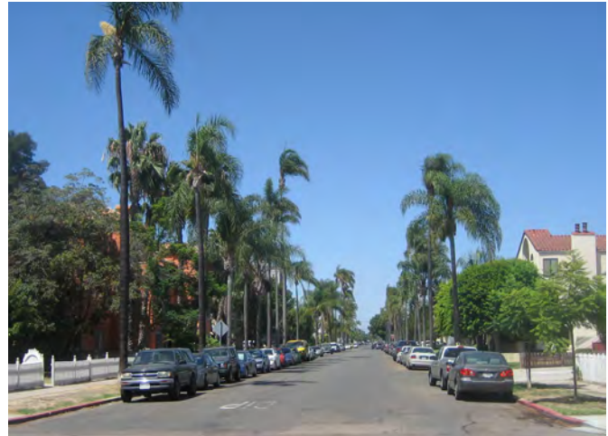
Third Avenue in Park West is characterized by a generous width and lined with palm trees.