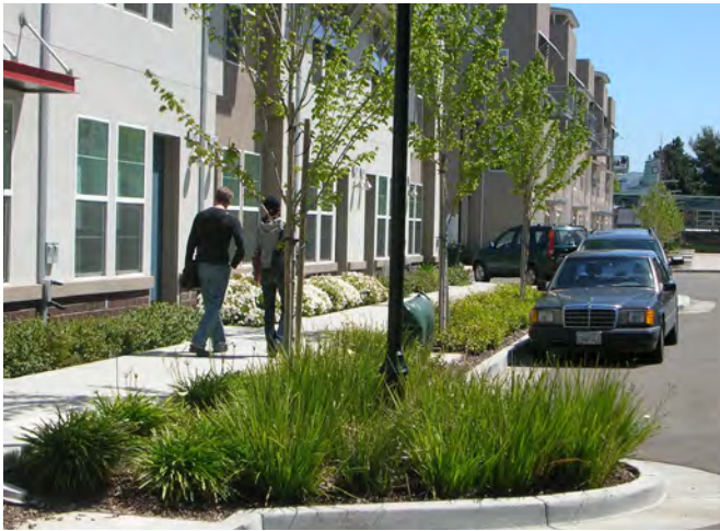
Drought-tolerant landscaping should be used in public realm landscaping to ensure consistency with sustainable development goals.