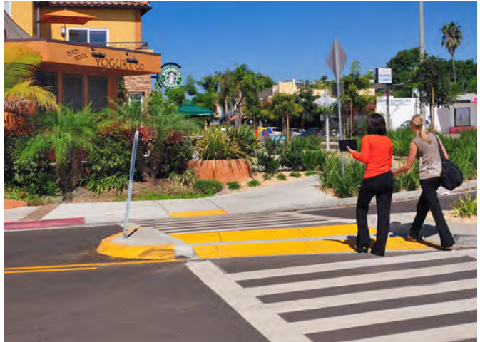
Mid-block crosswalks may be considered where serve an important pedestrian linkage.

Design strategies to reduce crossing distances include: