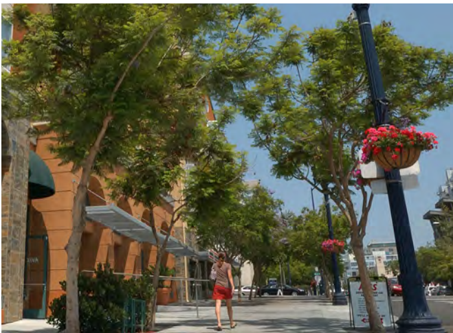
The combination of streetscape elements create a distinct sense of place for neighborhoods throughout Uptown.