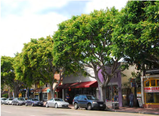
Street trees create a positive streetscape environment and define neighborhood character, such as on Fifth Street in Hillcrest.

4.3.12.4 Establish a citywide Street Tree Program that supports community implementation of street tree plans once developed, and empowers community members to get actively involved in greening their own streets.