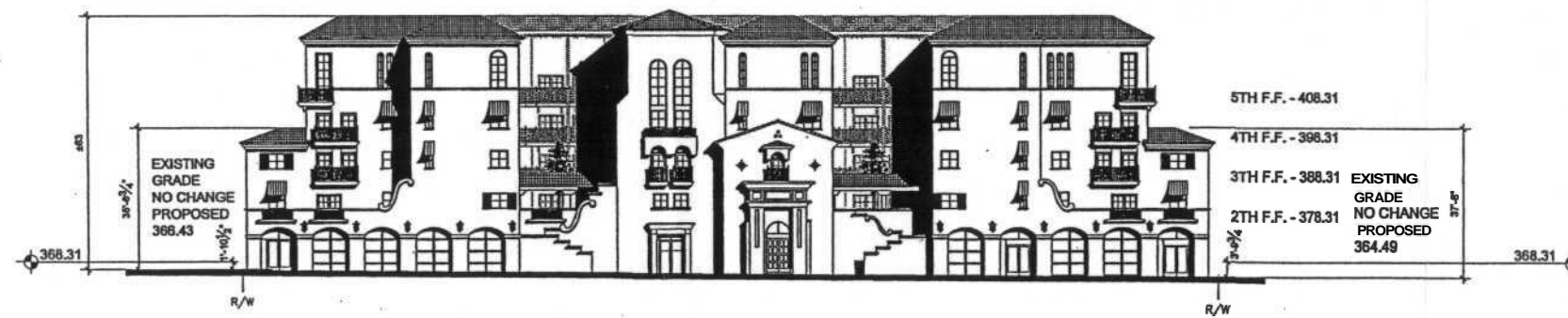
West Elevation: 30th. Street