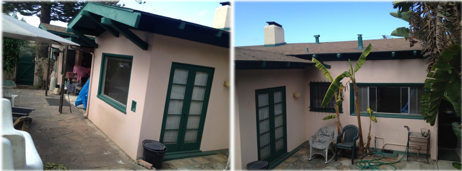
Photos Included in the Applicant's Report Taken Prior to Alterations