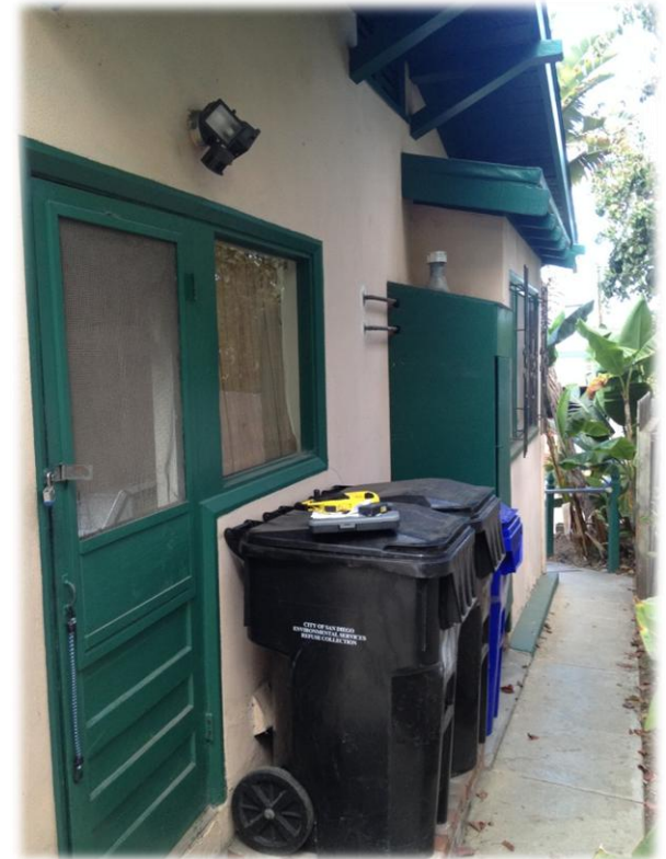
Photos Included in the Applicant's Report Taken Prior to Alterations