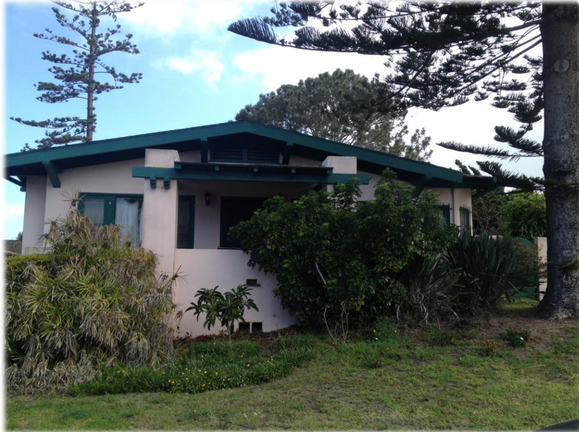
Photos Included in the Applicant's Report Taken Prior to Alterations