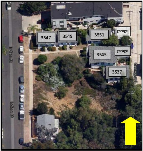
Approximate Parcel Lines