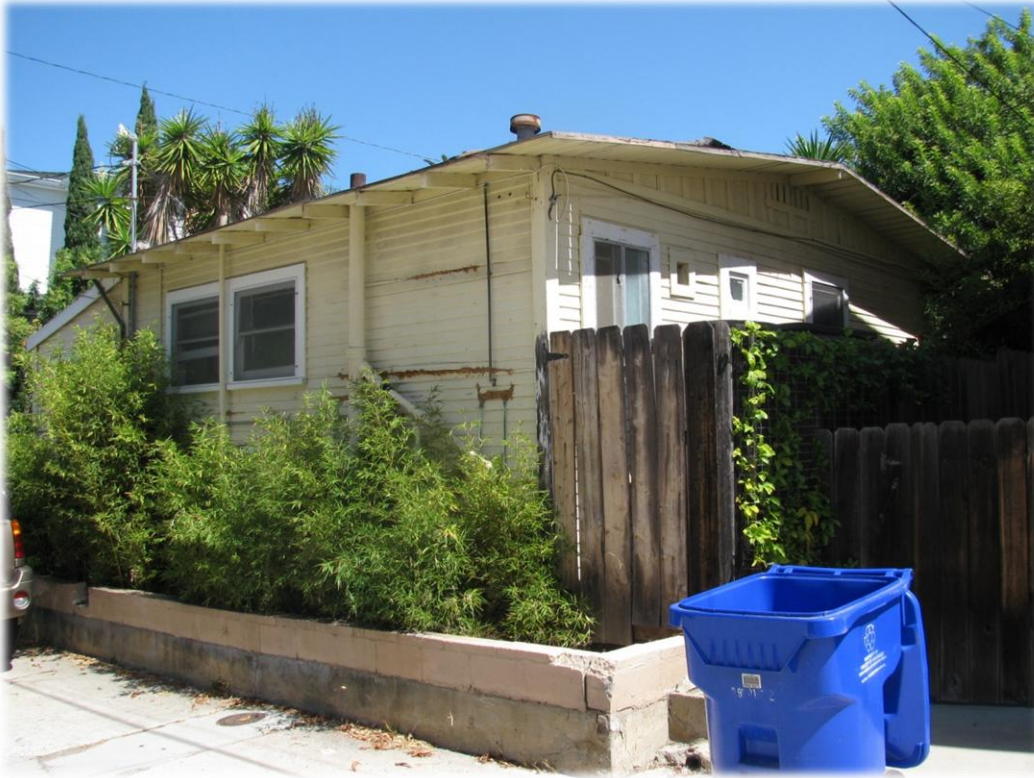
7224½ Fay Avenue