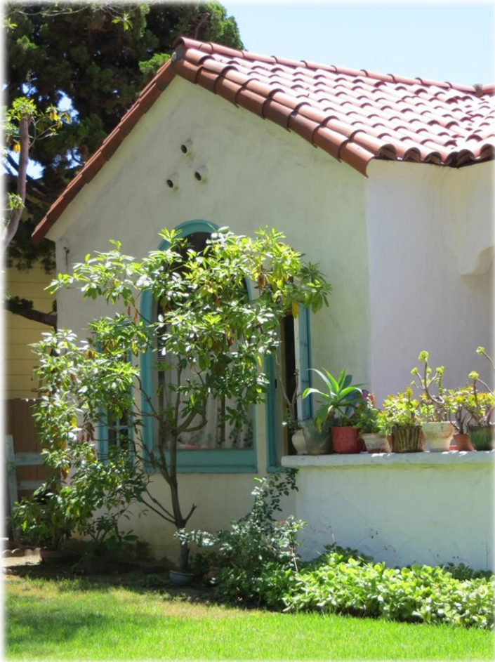
7224 Fay Avenue