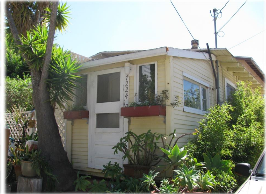
7224½ Fay Avenue