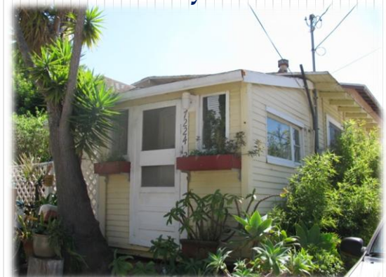
7224 ½ Fay Avenue