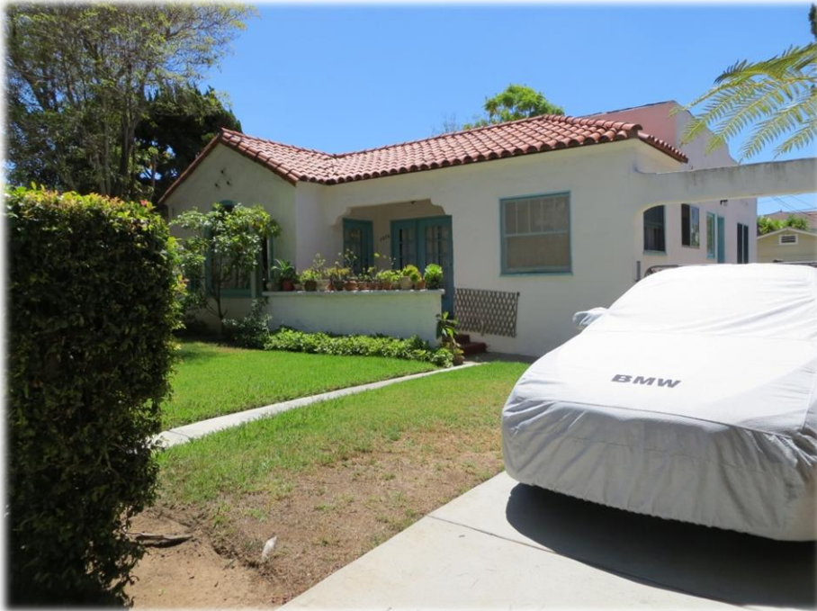
7224 Fay Avenue