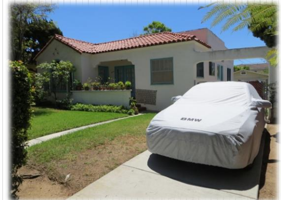
7224 Fay Avenue

The designation excludes the detached garage structure.