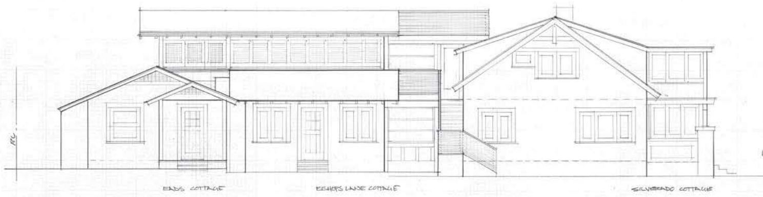
ENDS COTTAGE BISHOPS LANE COTTAGE SILVERADO COTTAGE