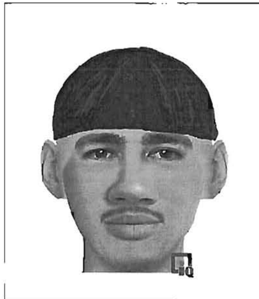
Photo created using the services of a composite artist from a composite studio. Based on the description of the suspect provided by the police and the composite artist's skill. Created using iQ, The Ultimate Composite System™ © IQ Systems, 2007

Anyone with information on the identity or location of this suspect is asked to call the SDPD (619) 531-2000. You may also call Crime Stoppers anonymous, toll-free tip line at (888) 580-TIPS. You could be eligible for a reward of up to $1000 dollars for information that leads to an arrest in these cases.