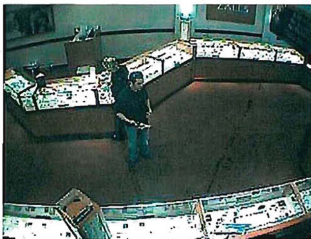
Photos of suspects wanted for identity theft.