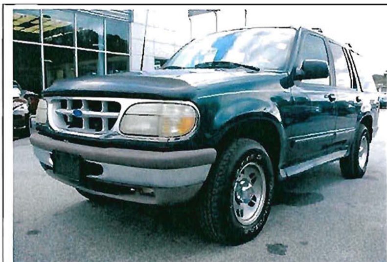
Similar to Suspect Vehicle, Green Ford Explorer