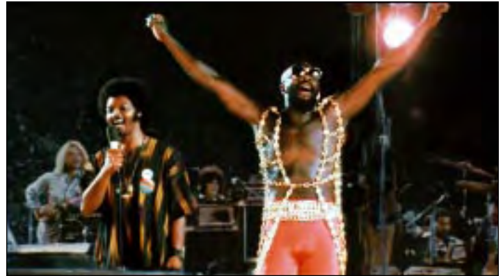
The Rev. Jesse Jackson, left, introduces performer Isaac Hayes in the film “Wattstax.”

Hosted by the Rev. Jesse Jackson, Wattstax was a veritable who’s who of gospel, soul and R&B and was a mirror of various aspects of African-American culture. The newly restored concert film features trenchant commentary from comedian Richard Pryor, performances by Rufus