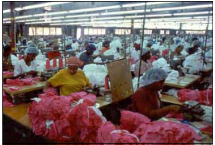
The film "Life and Debt" focuses on Jamaica as a prime example of the impact economic globalization can have on a developing country. "Life and Debt" is one of 13 documentaries the Library recently was awarded for its growing video collection.

For information about these and other videos in the Library collection and for up-to-date information on film screenings and other library programs, visit the Library on the City's Web site at http://www.sandiego.gov/public-library or call the Central Library's Art, Music & Recreation Section at 619-236-5810, touch 7.