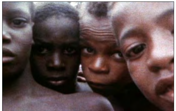
"E Minha Cara" traces a filmmaker's journey to Brazil, as he seeks the identity of the spirits who haunt his dreams. The film will be shown Sept. 20 at 6 p.m. at the Central Library.

The San Diego region is an ethnically and culturally diverse community due to its proximity to the U.S.-Mexico border, its location on the Pacific Rim, and the presence of one of the largest military complexes in the nation. According to the 2000 U.S. Census, San Diego's foreign-born population grew by 70 percent between 1980 and 1990. "Stories of Faith" will focus on neighborhoods to the south and east of downtown and in the City Heights community. These areas are some of the most diverse in the region and host many of the newly arrived immigrant groups from around the world. The