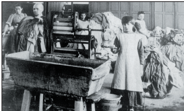
Thirty thousand Irish women and girls were banished to the Magdalene Laundries where many endured a lifetime of isolation, enslavement and suffering.

Many Magdalens who were unwed mothers were forced to give up their children up for adoption to Irish Catholic families in the United States. The discovery of the unmarked graves of 133 women on the convent grounds at the Magdalene Laundry in Dublin in the mid-1990s inspired wide-spread outrage and focused attention on this