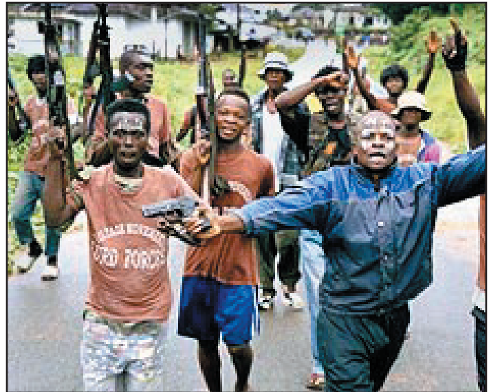
The documentary film “Liberia: An Uncivil War,” to be shown at the Valencia Park/Malcolm X Branch Library on Oct. 4, gives a palpable sense of life in a war zone.

During a series of exclusive interviews with Taylor, he tells his side of the story, challenging America’s moral legitimacy at every step. Taylor presents a complex figure