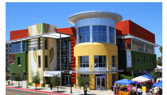
La Maestra Center