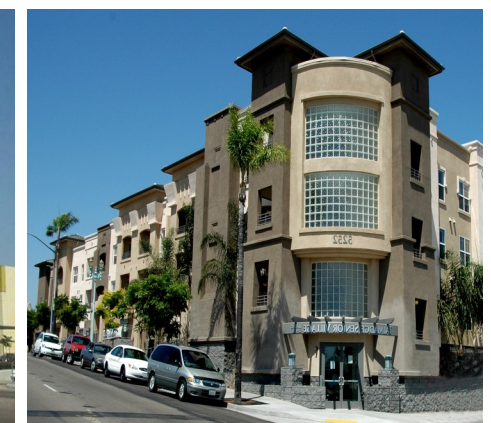
Talmadge Senior Village