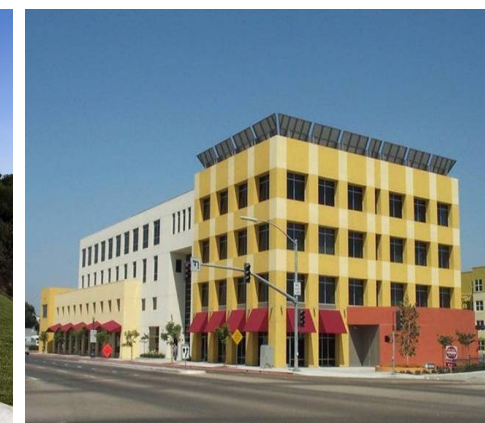
Metro Career Center