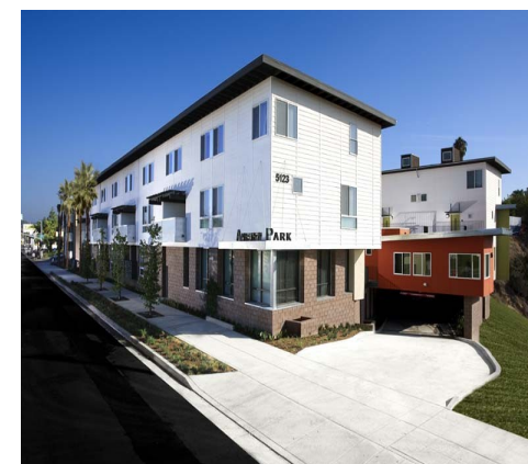
Auburn Park Apartments