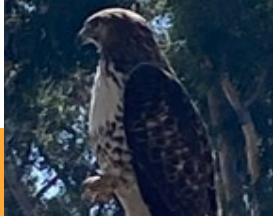
Osprey at Chollas Lake Park ( Pandion haliaetus )