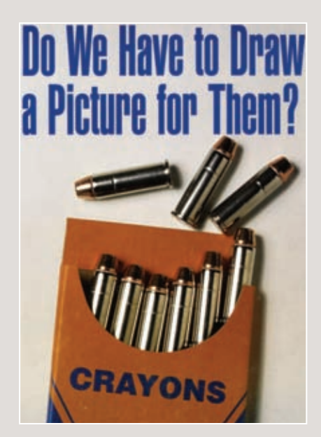
Poster for "Do We Have to Draw a Picture for Them?" an instructional video produced in 1998 as part of Prevent Handgun Violence Against Kids, a multifaceted public education campaign to reduce access to handguns among youth. The campaign was funded by a TCWF grant to Martin & Glantz, LLC.

The first statewide VPI conference in 1993 brought together grantees representing a diverse set of perspectives. But that gathering also stirred tension as different groups advocated their own