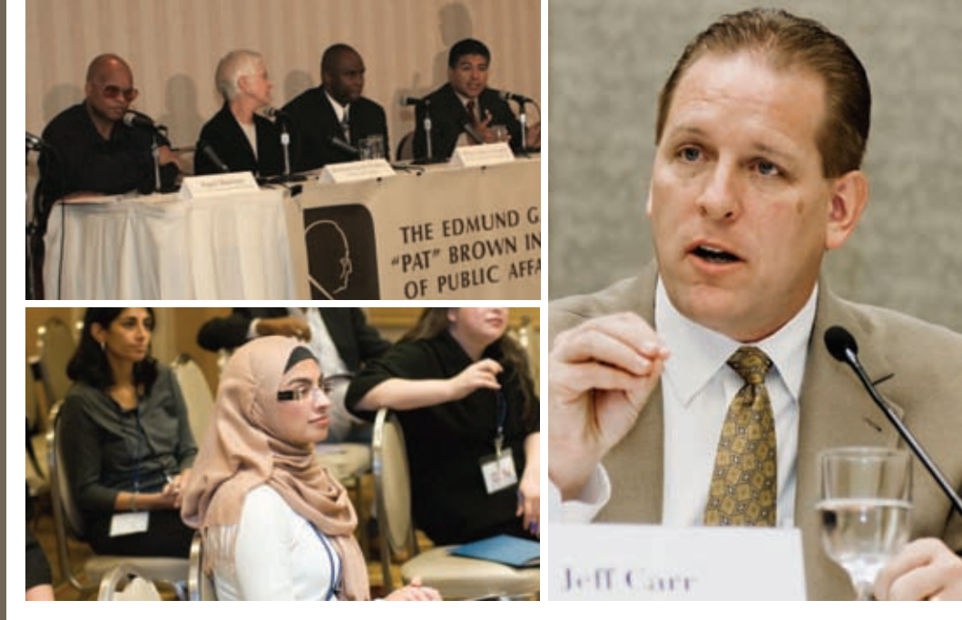
TCWF-sponsored conferences and events — such as these — provide a space for nonprofit providers, advocates, researchers, policymakers and others from diverse sectors to build skills, develop knowledge and facilitate the discovery of unexpected allies.