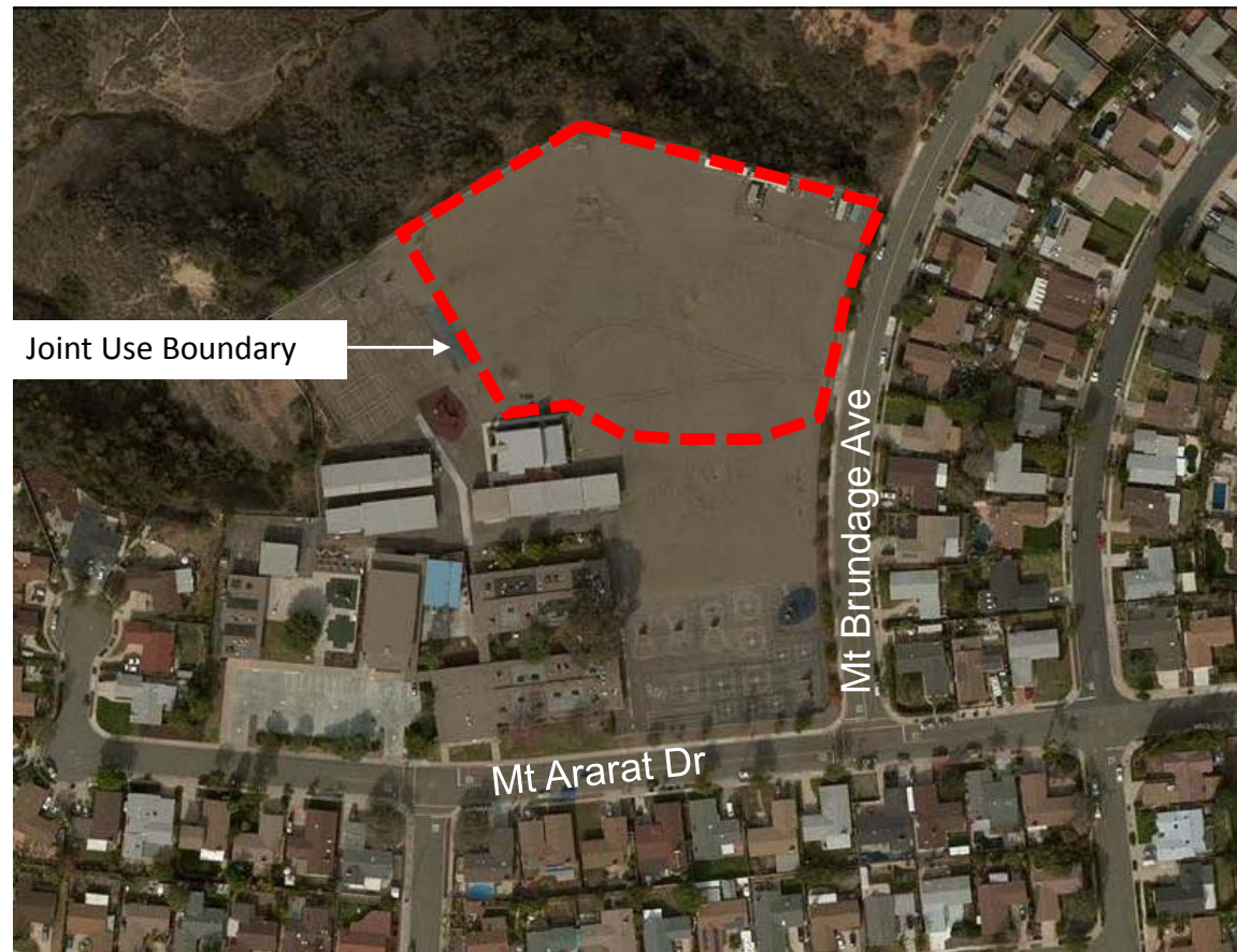
Site Location, Aerial Map

San Diego Unified School District Proposition S & Z Capital Improvement Bond Program