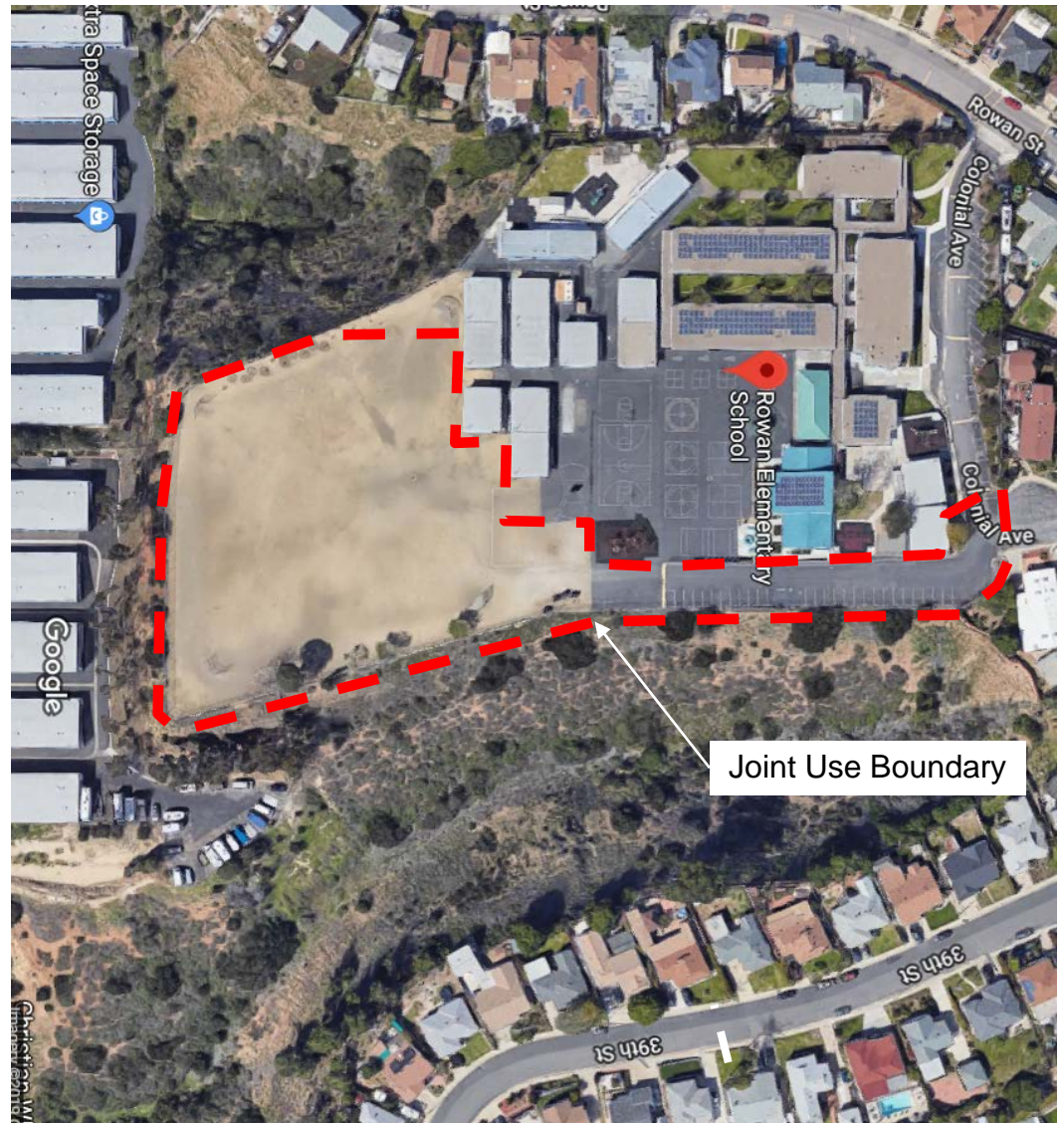
Site Location, Aerial Map

San Diego Unified School District Proposition S & Z Capital Improvement Bond Program