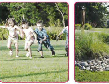
turf field drought tolerant planting