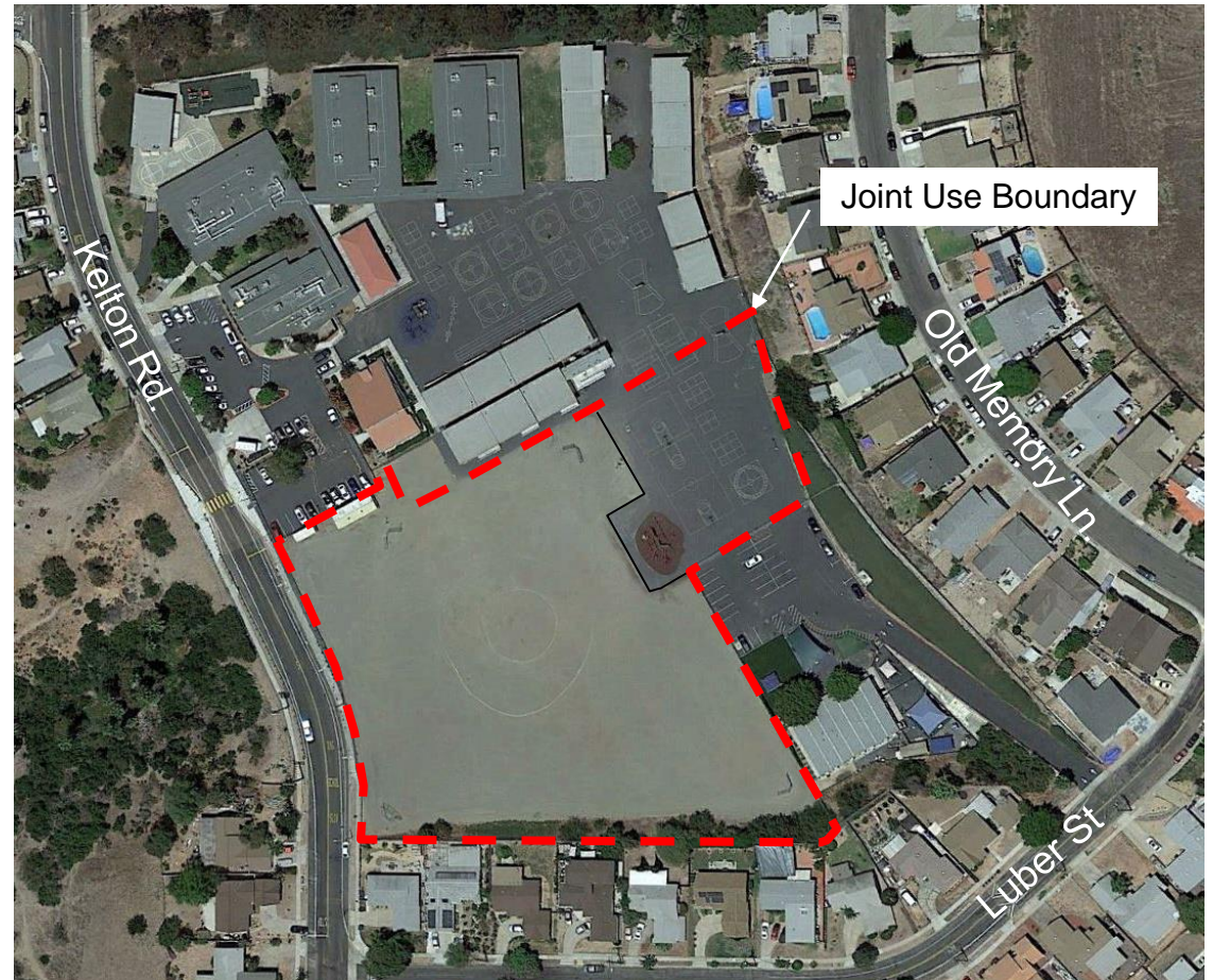
Site Location, Aerial Map

San Diego Unified School District various Capital Improvement Bond Program measures.