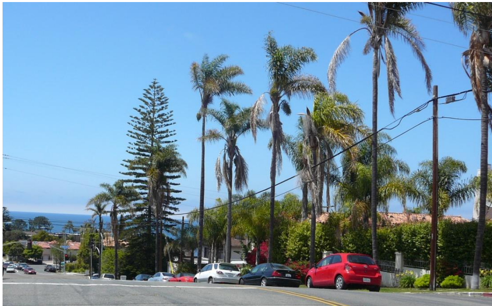
Picture 3971 - Palm Trees along Prospect Place