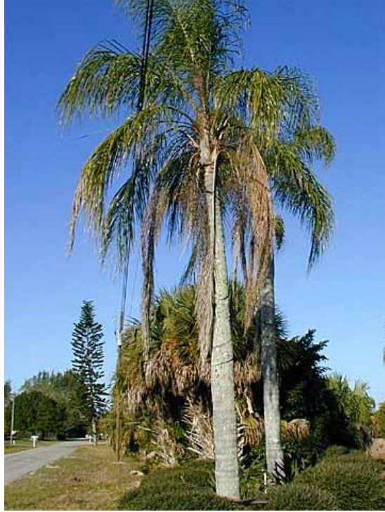
Picture 2 - Queen Palm