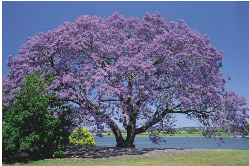
Picture 5 - Jacaranda