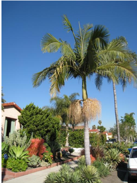
Picture 3 - King Palm