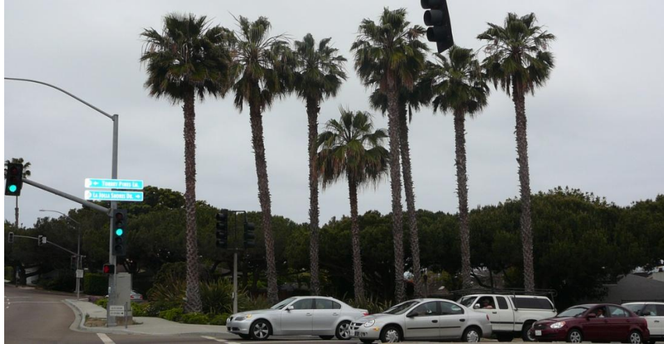
Picture 3905 - Palm Trees at the intersection of Torrey Pines Road and La Jolla Shores Drive