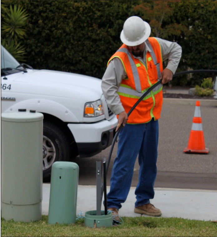
A crew member installs utility cables into the underground conduit.

All panel and trench work is completed. If you have any questions or concerns about the electrical or trenching work completed on your property, please do not hesitate to contact the contractor listed on the door hanger we left at your property.