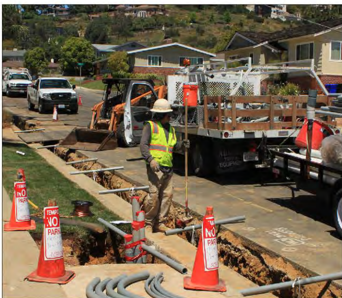
Construction crew member installs conduit lines.

You have likely seen trenching crews working in the streets. Trench work is approximately 80% complete in Project Block 7CC. We ask for your patience as they complete this work, as it can be disruptive and distracting. Approximately two weeks prior to the start of the trench work on your property and in the street, you will receive a door hanger with the trenching contractor's name and phone number on it. If you have any questions or concerns about the work, please do not hesitate to contact the contractor.