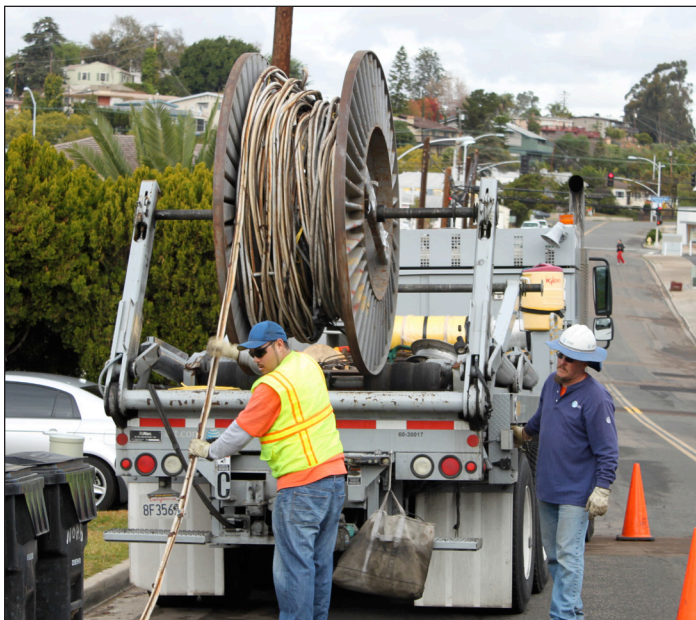
Crew members roll up recently removed overhead utility lines.

AT&T is 100% complete with cabling, 80% complete with customer cut-overs and 60% complete with overhead line removal activities.