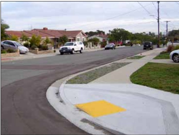
Recently finished pedestrian ramp.

Trench work is 100% complete in Project Block 2E/Mission Hills