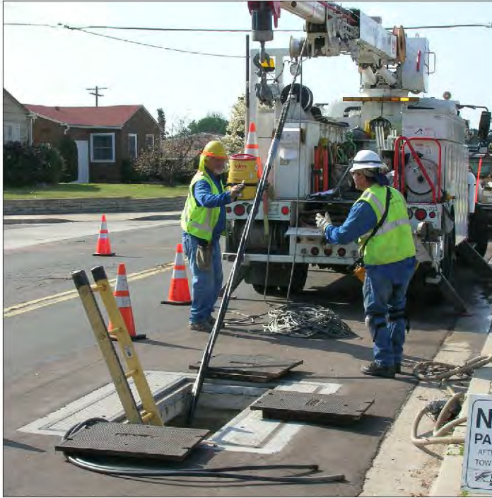
Crew members install the new underground utility cables.

All panel and trenching work is complete. If you have any questions or concerns about the electrical or trenching work completed on your property, please do not hesitate to contact the contractor listed on the door hanger we left at your property.