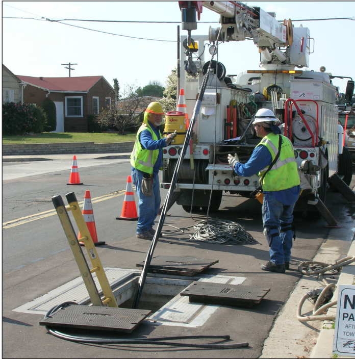
Crew members install the new underground utility cables.

All panel and trenching work is complete. If you have any questions or concerns about the electrical or trenching work completed on your property, please do not hesitate to contact the contractor listed on the door hanger we left at your property.