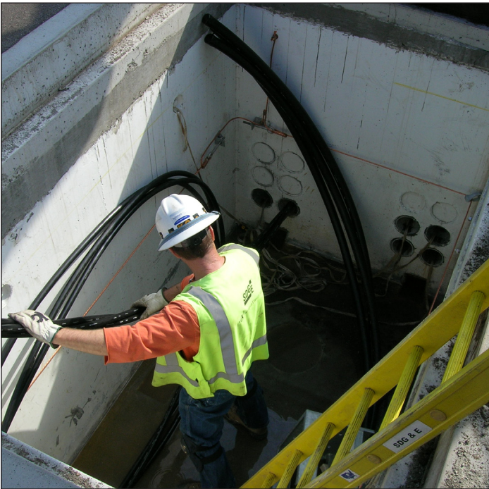
Crew member installs underground utility cables.

Trench work is 100% complete in Project Block 8G.