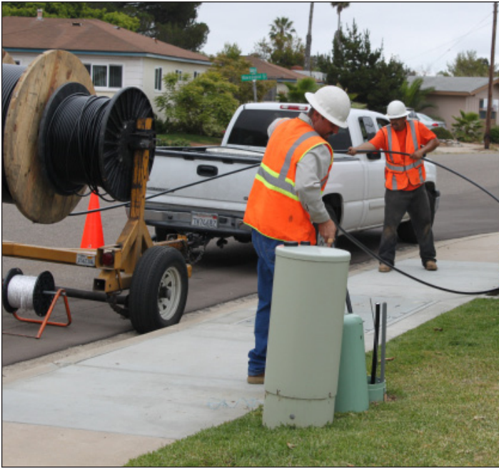
Crew members install cables.