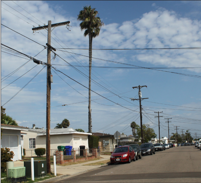
Starting in October, the overhead lines will be removed.

Trench work is 100% complete in Project Block 6I.