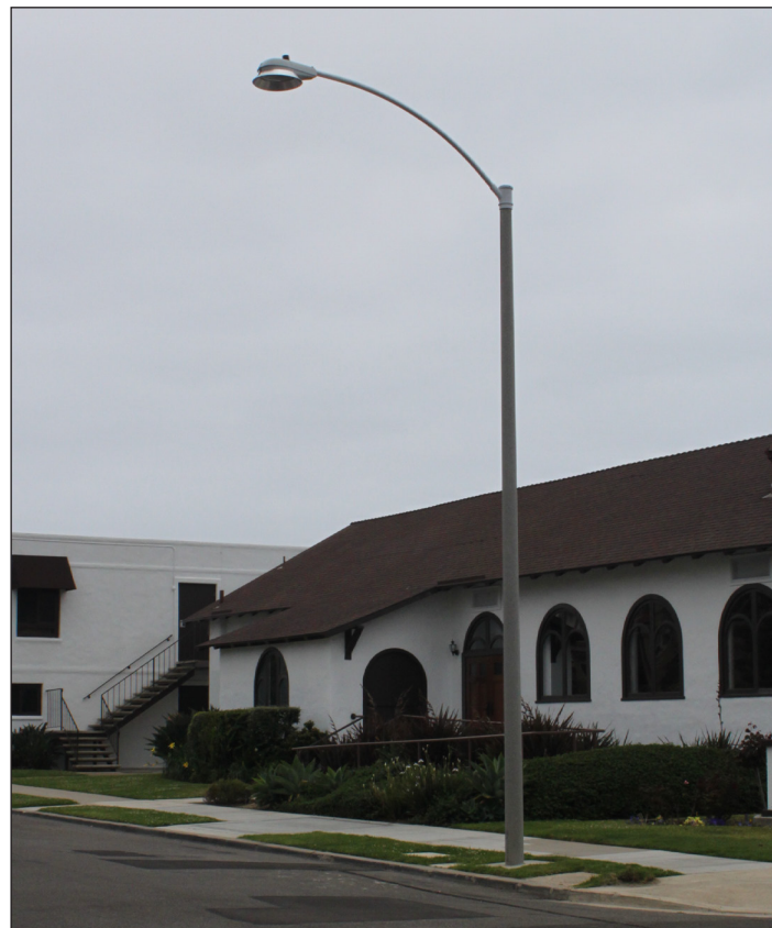
Sixty-seven new streetlights, like the example of one pictured above, are currently being installed throughout the project block.

AT&T is 100% complete with their cabling, cut-over activities and overhead line removal activities.