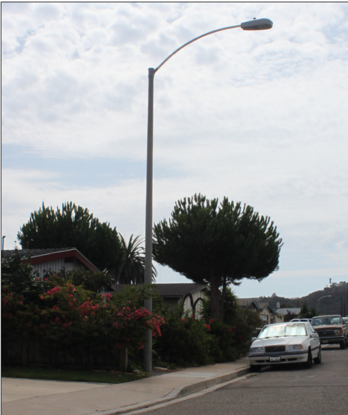
Throughout the project block new streetlights are being installed and activated.

AT&T is 100% complete with their cabling, cut-over activities and overhead line removal activities.