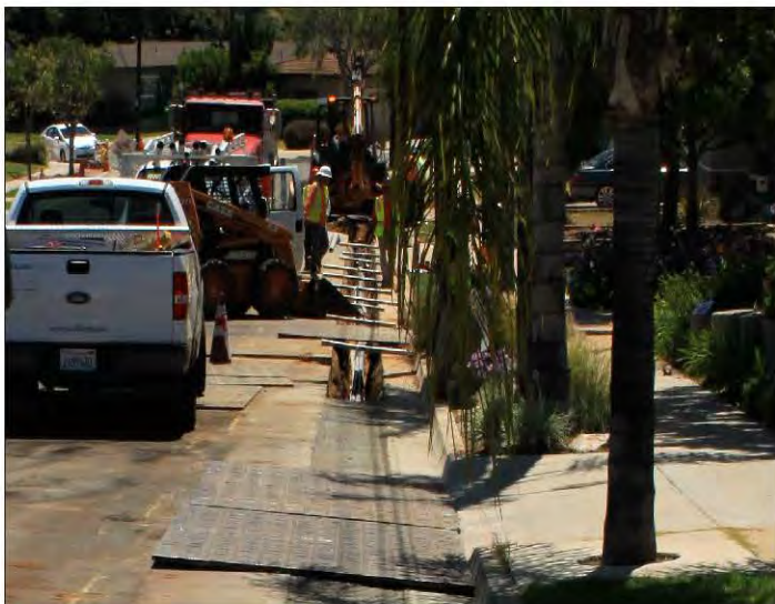
Construction crew members cement over newly installed conduit lines.

You have likely seen trenching crews working in the streets. Trench work is approximately 85% complete in Project Block 7CC. We ask for your patience as they complete this work, as it can be disruptive and distracting. Approximately two weeks prior to the start of the trench work on your property and in the street, you will receive a door hanger with the trenching contractor's name and phone number on it. If you have any questions or concerns about the work, please do not hesitate to contact the contractor.