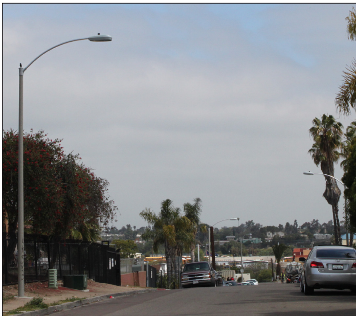
Overhead lines have been removed and streetlight installation is complete, creating clearer views throughout the neighborhood.

AT&T is 100% complete with cabling and cut-overs and 90% complete with overhead line removal activities.