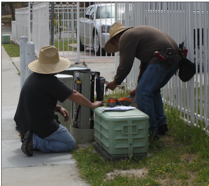
AT&T crew members test phone lines to confirm cut-over activities were successful.

AT&T is 100% complete with cabling, 95% complete with customer cut-overs and 80% complete with overhead line removal activities.