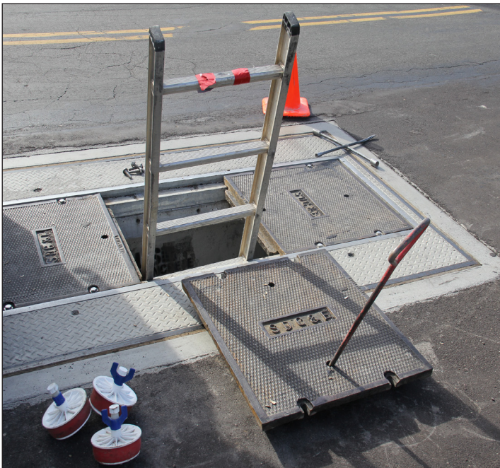
New cabling will soon be installed in this SDG&E electrical vault.

Trench work is 100% complete in Project Block 2E/Mission Hills.