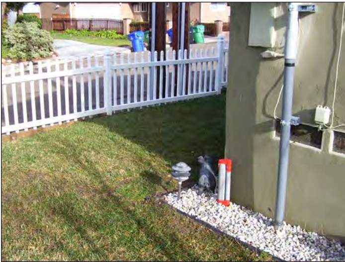
Recently installed conduit lines at a customer's property.

Trench work is 100% complete in Project Block 2E/Mission Hills.