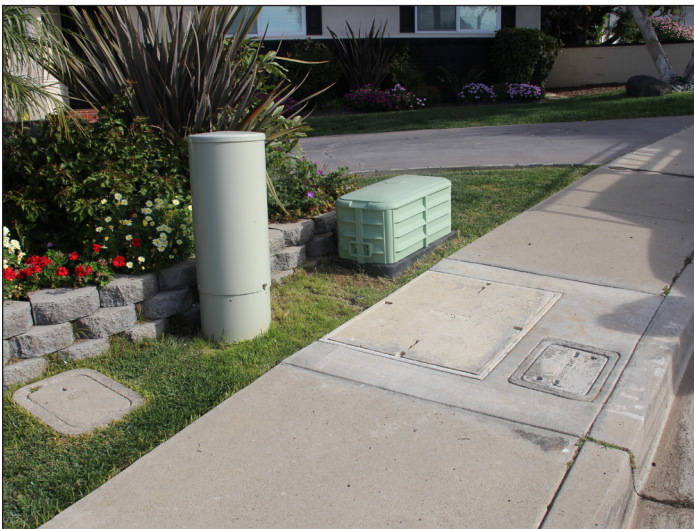
Crews connect utility cabling from the customer's panel to the new pedestal boxes, as pictured above.