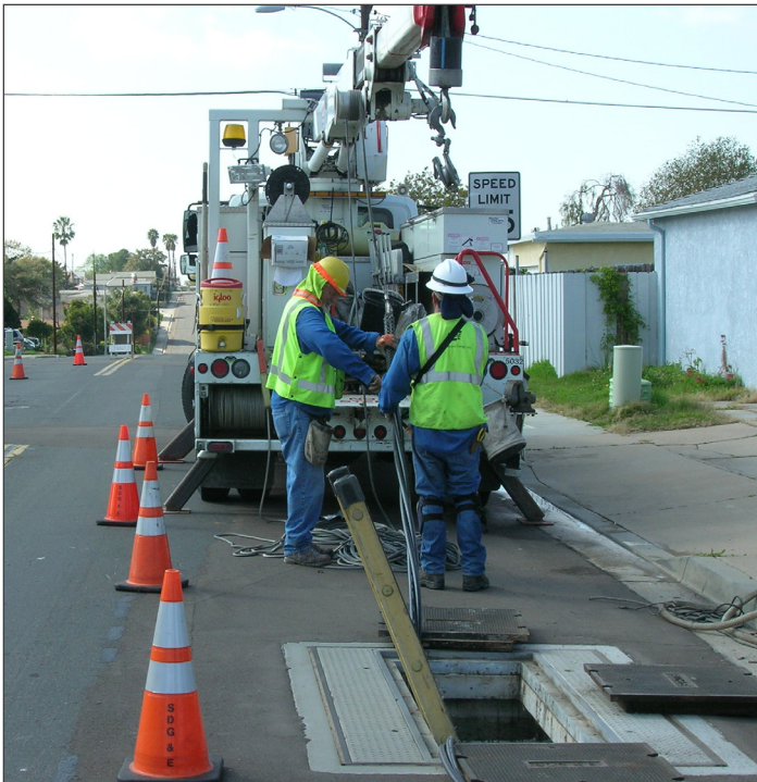
Crew members install the utility cables into the underground conduit.

After all trenching operations have been completed by our contractor, the cabling portion of the work will begin. Another contractor will perform the cabling work. Cabling involves technicians placing new utility lines in the new conduits, so that the new lines can be "energized" and brought into service. Once the new system has been energized, the process to "cut-over" customers from overhead to underground services will begin. Once customers have been cut-over, the overhead lines will be removed. We anticipate this process will move very swiftly and it's not nearly as disruptive or distracting as the trenching work, which is why you may not even see us working.